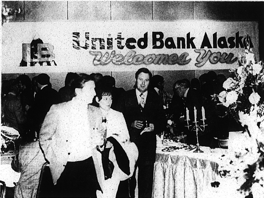
REFRESHMENTS—During the grand opening of the United Bank of Alaska (Native Bank) in the City of Anchorage, some 400 people came to take part in the festivities. The bank was established from a pool of money from several Native corporations.