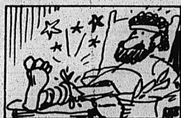
Galen, a second century Greek physician, prescribed dogwood leaves for wounds.

The consensus of the participants was the conference was a success but more followup strategy needs to be pursued according to Smith.