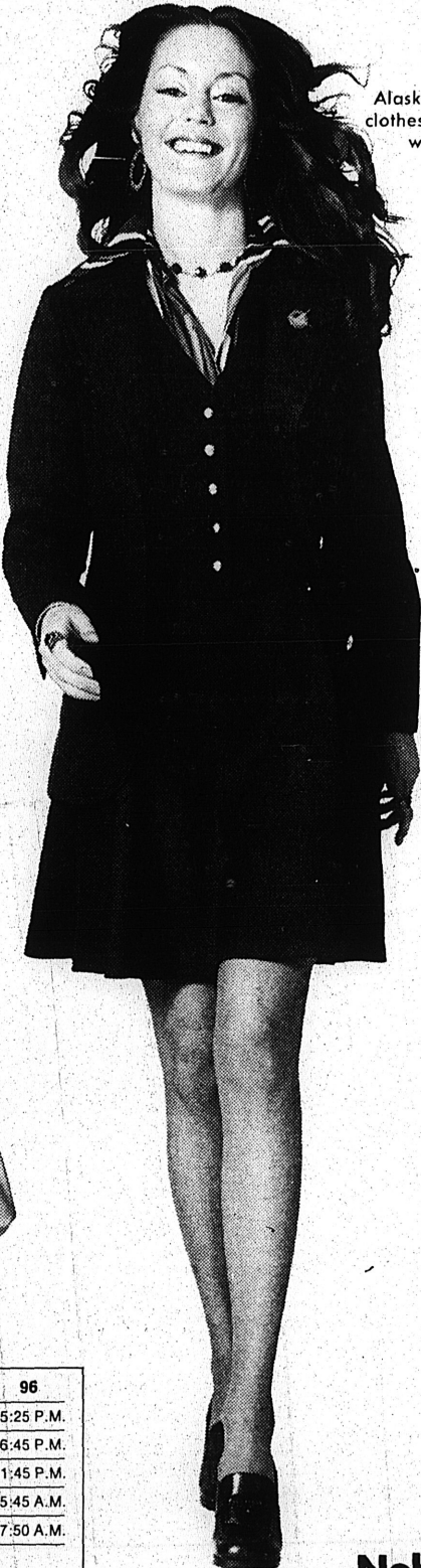
Alaska Airlines has changed clothes. Watch a fashion show walk down the aisle.