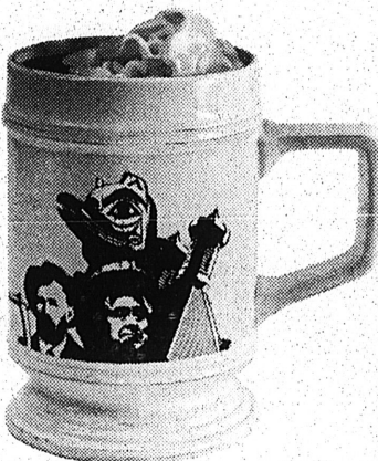
The official Top of the World Drink. Sourdough Coffee Royale for breakfast. And complimentary wine with lunch and dinner—for everyone on board who's old enough.

Because we figure it this way. It's not how many flights a day there are, it's what kind of service you get on the one flight you take. Ask your travel agent to put you on Top of the World.