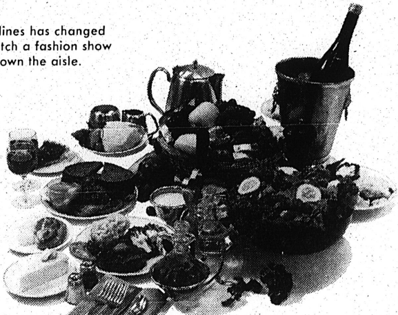
Eat your way to the Top of the World with meals like steak, fresh tossed green salad, baked stuffed potato and Bavarian Cream Pie.