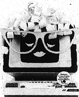
Alice is Tops. Nobody knows more about reservations than Alice, our IBM-360 computer and super reservations gal. Call and find out.