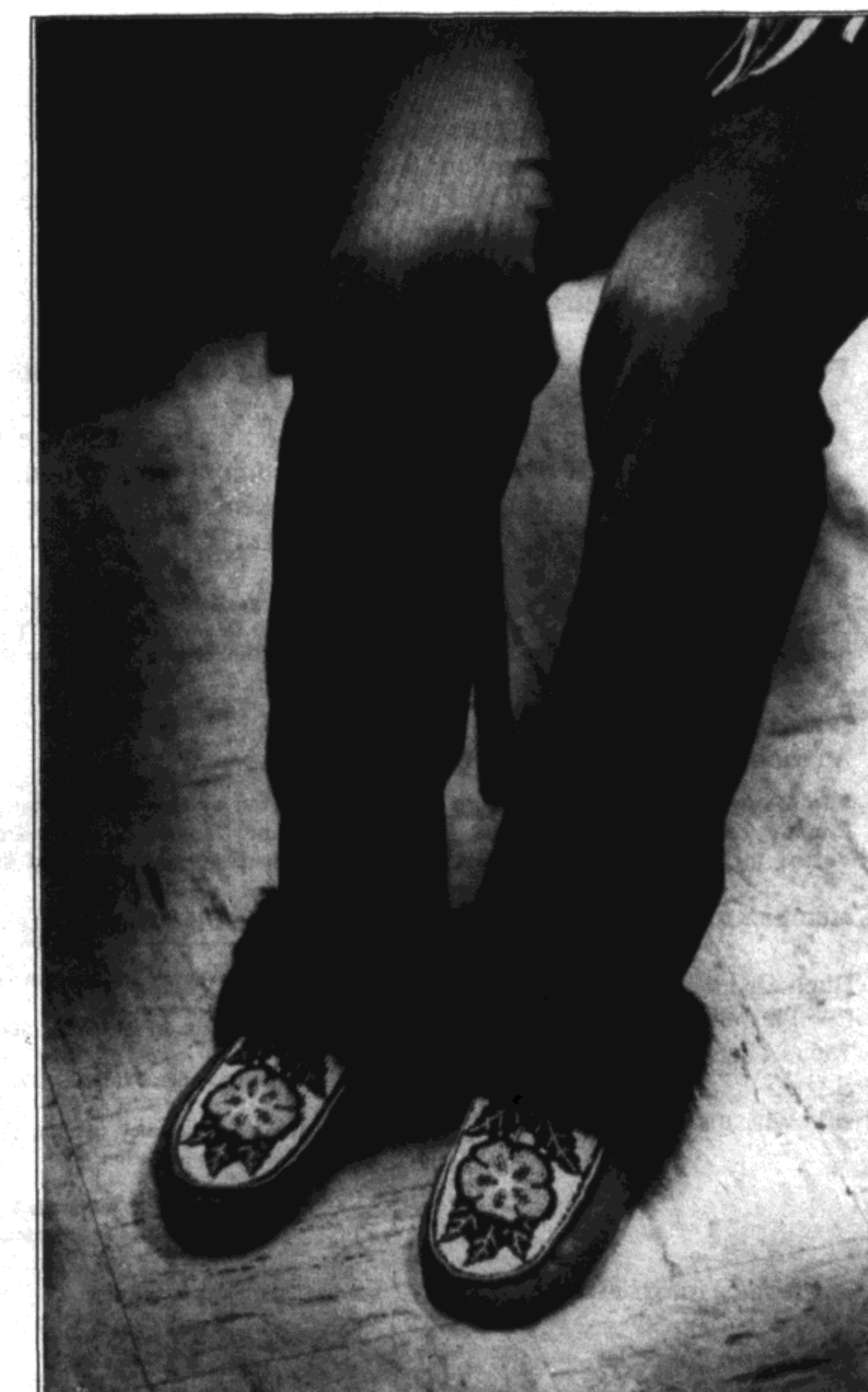
Fiddlers new beaded slippers tapping out a tune.