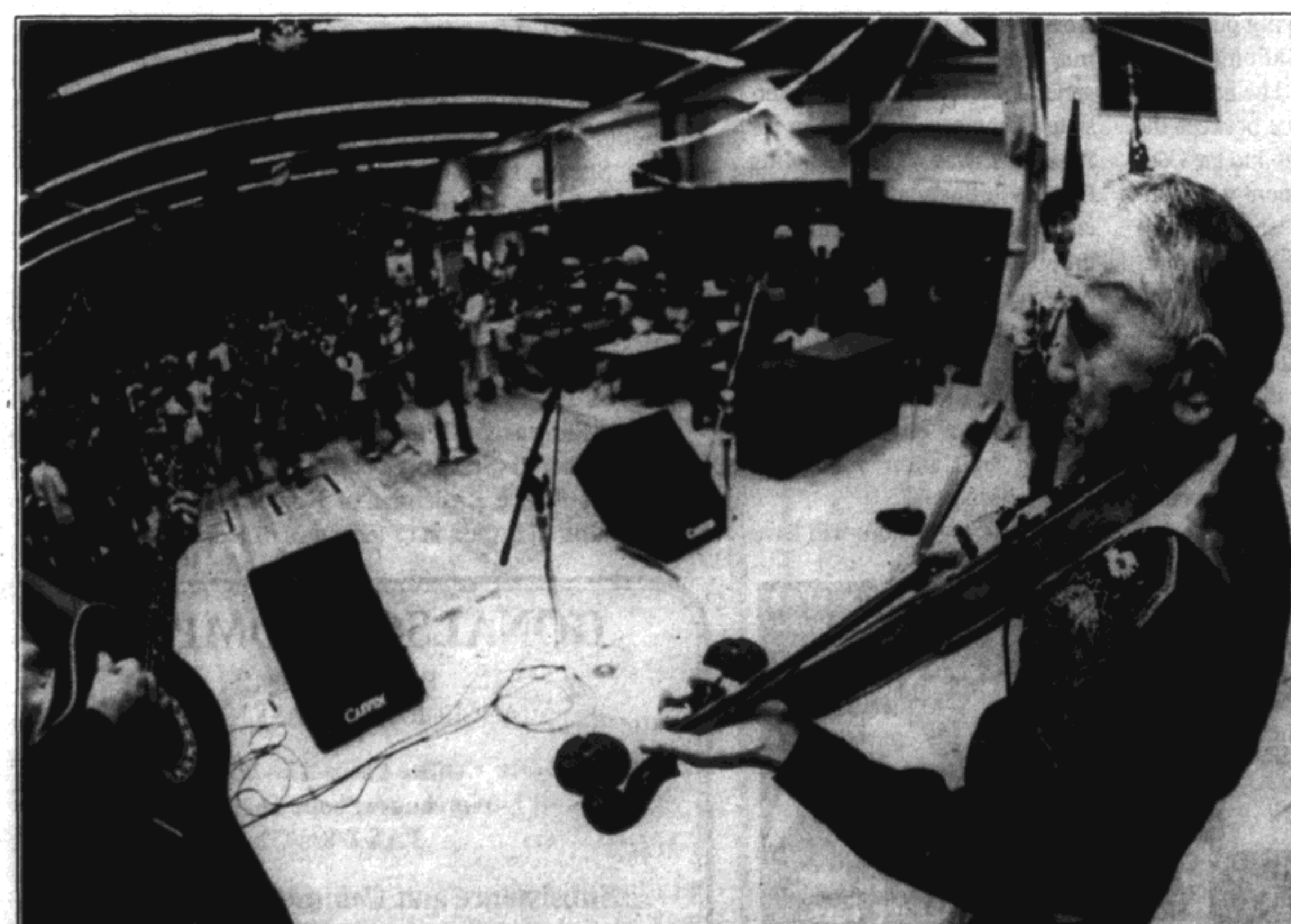
Vincent Yaska on stage.

Dancing and jigging with no strings attached