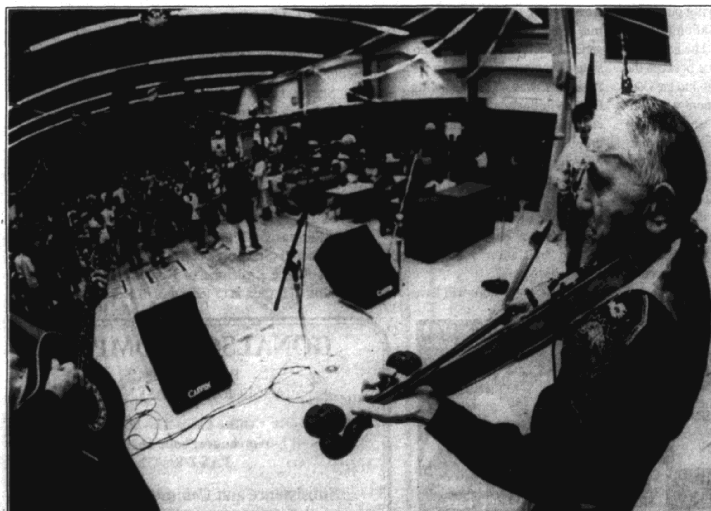
Vincent Yaska on stage.