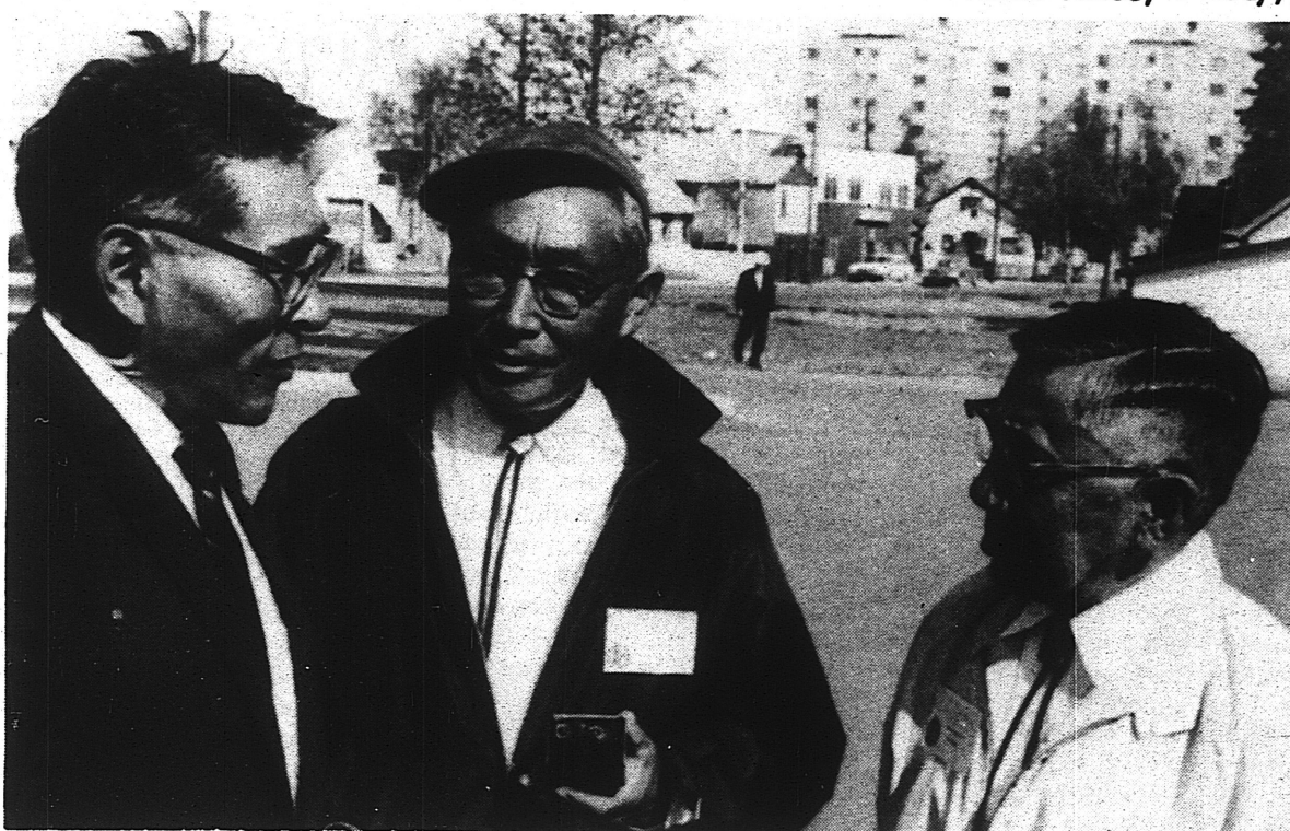
POSTMASTERS—Up early for the meeting of the National Association of Postmasters, Alaska chapter, at Traveler's Inn, Fair-

Fairbanks Insurance Agency 551 3rd Avenue, Fairbanks