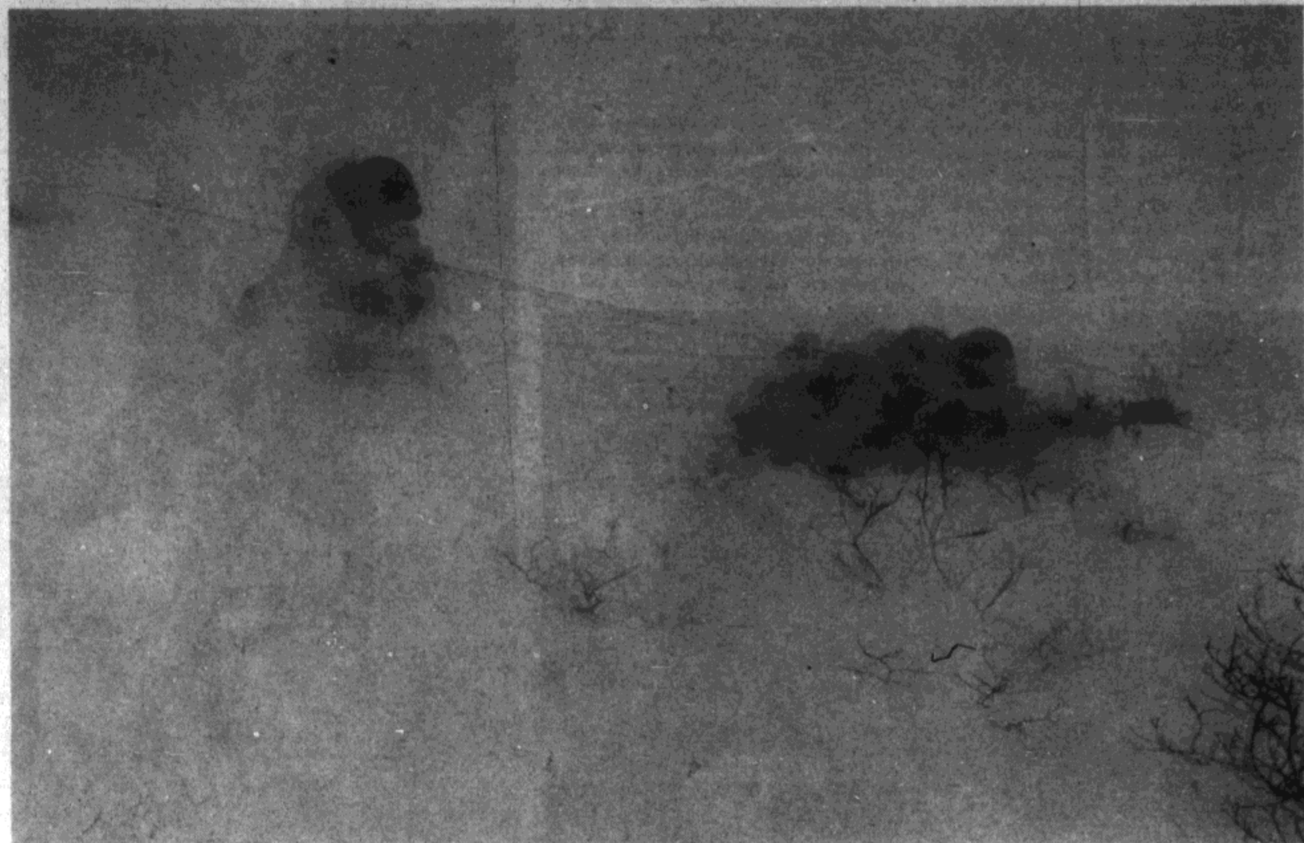
Blowing snow obscures two guardsmen (above) about to launch an uphill attack. One soldier (below left) fires an "enemy" helicopter during the attack. Soldiers know they have been hit when lasers activated by blank rounds activate buzzers which they wear.