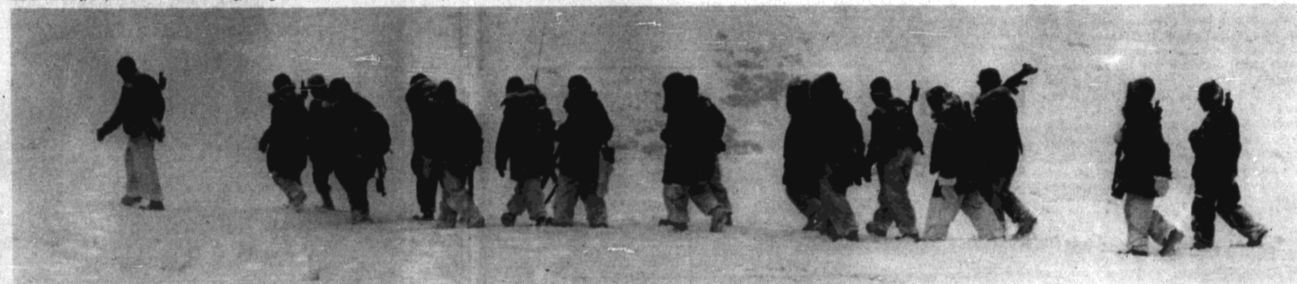
After the exercise, the guardsmen march through mountain terrain to their helicopter pickup point.