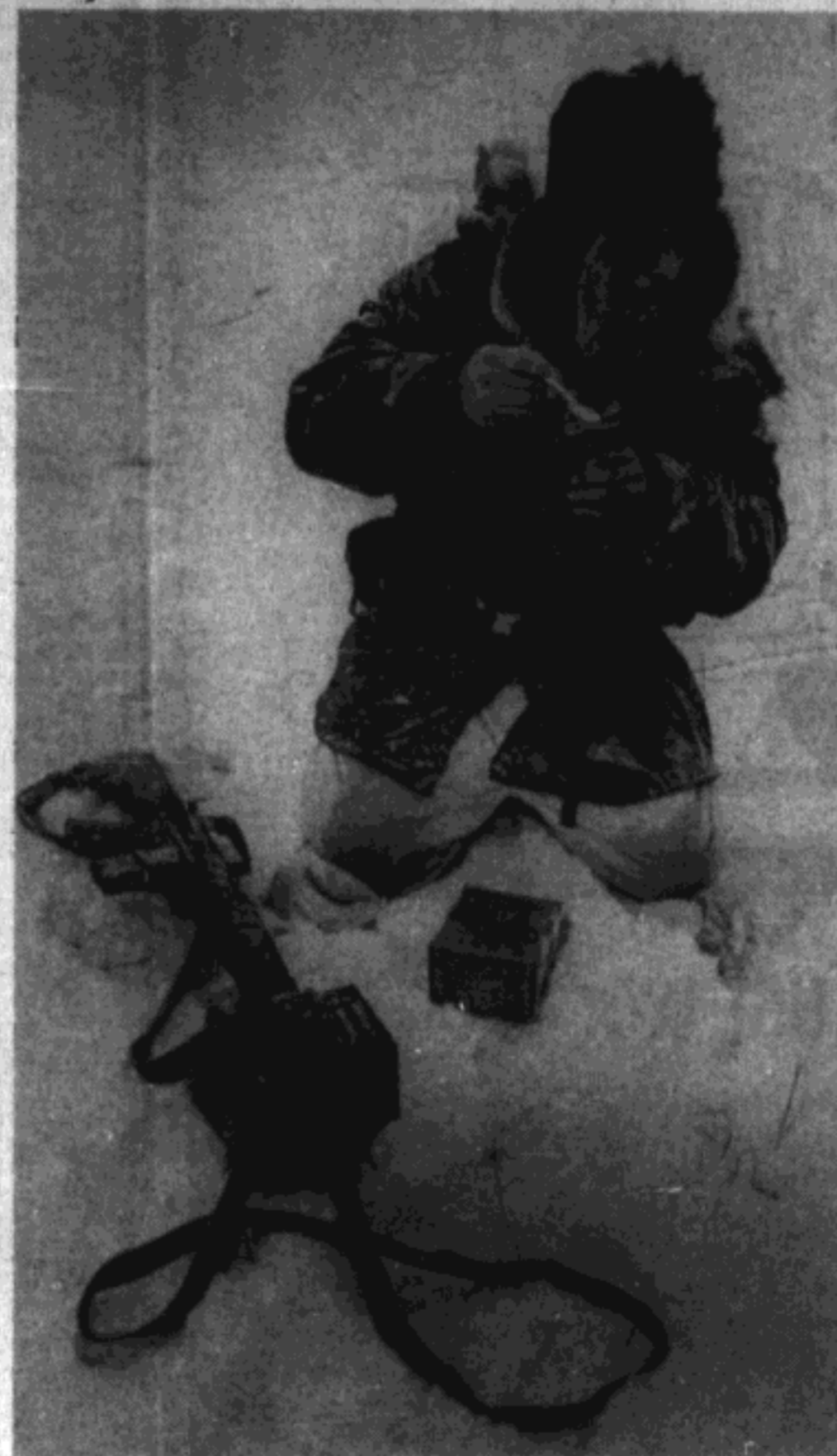
There was no seal meat, muktuk or moose for lunch, just cold C-rations.