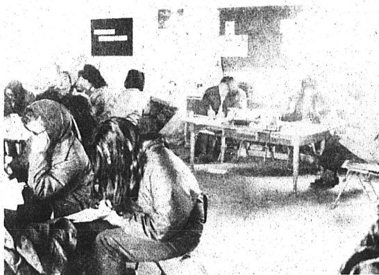
PICTURED ABOVE: Interested parents, teachers, and instructors at the Head Start Workshop in Noorvik.