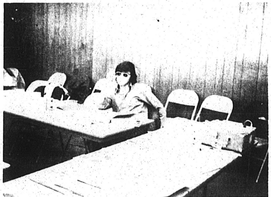
THE NEWLY-HIRED DIRECTOR of the Koyukon Development Corporation pictured at the Regional Director's Meeting here in Anchorage, on October 11 and 12.