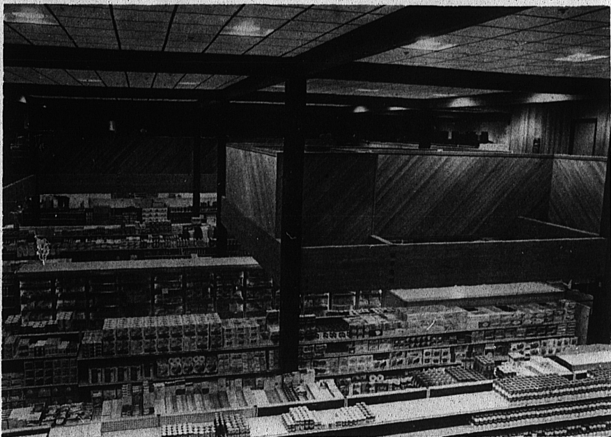
SHONTZ INC.'s new general store in Barrow has two levels. Pictured here is the lower level grocery section, with an office and sales area above.