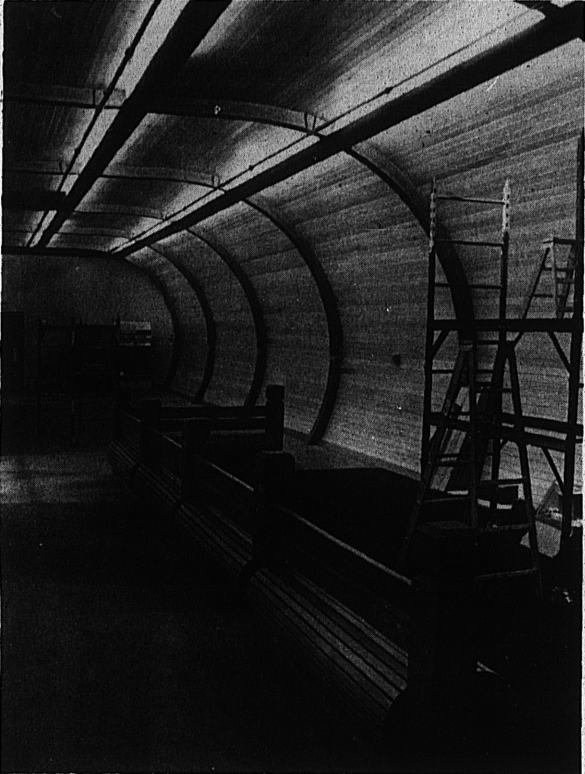
GEOMETRIC DESIGN dominates the entrance to Barrow's new store shown here in final stages of completion.