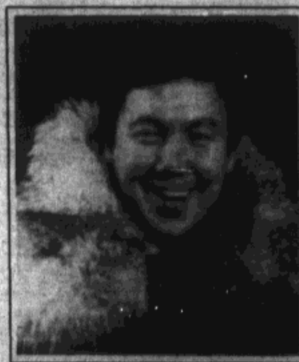
Senator Frank Ferguson