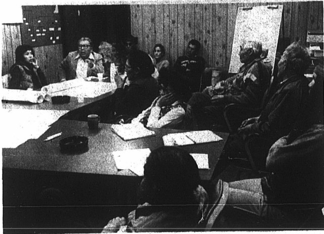
ELDERLY COPPER RIVER PEOPLE MEET - to discuss housing plans for two housing projects to be built in the Copper Basin.