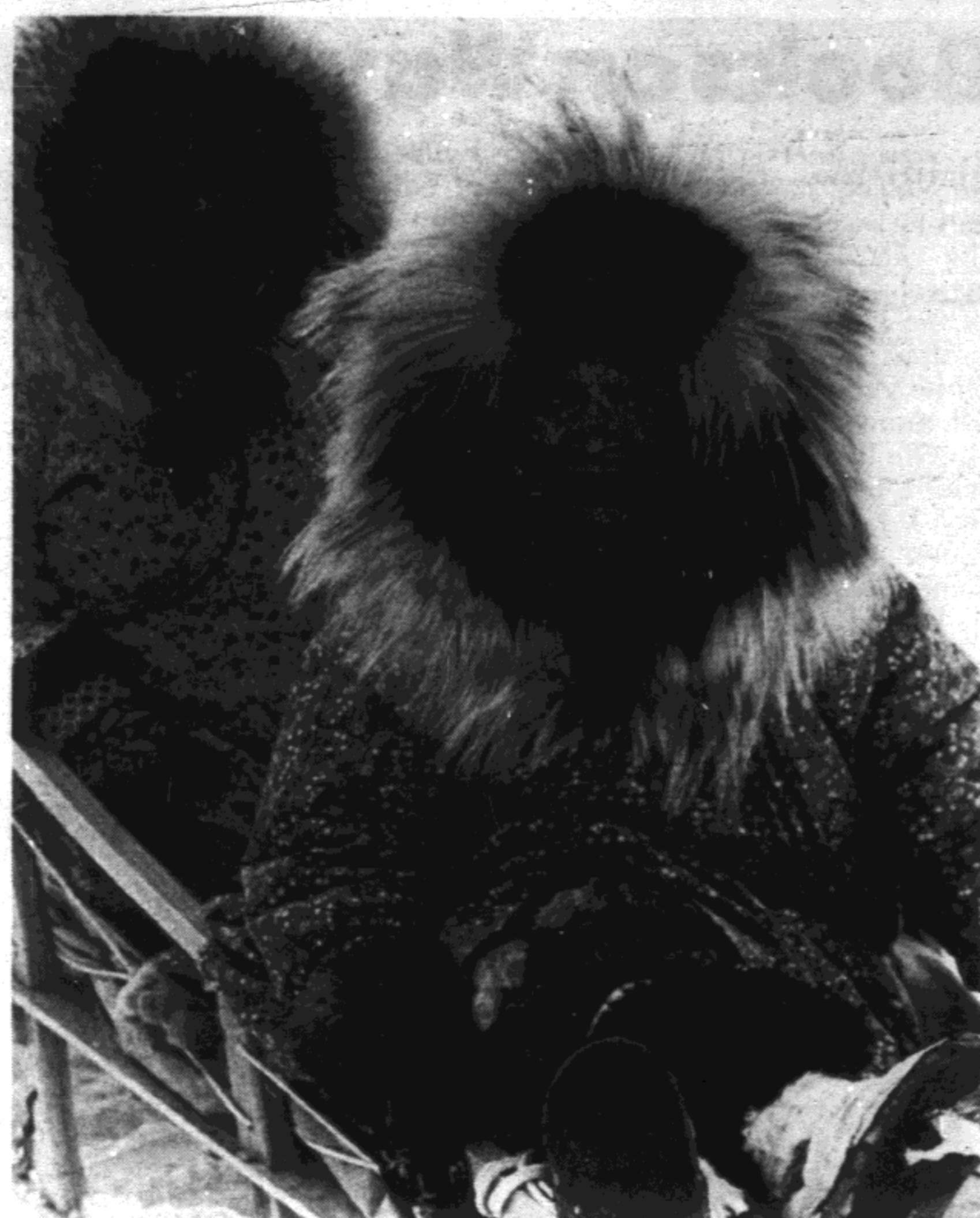
ELDERLY ESKIMO WOMEN —Kuskokwim City of Bethel goes for dog sled races in a big way. Sometimes, more than 100 teams converge there from the outlying villages. Recently, Bethel put on races for the Public Health Service personnel there which resulted in great fun. Two elderly Eskimo women reflect the fun had by all.

The hospital personnel will remember this past weekend with fond memories. They enjoyed being included in the club's activities.