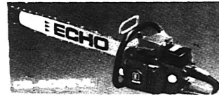
900 EVL weighs only 19.8 lbs. C.D.I. ignition auto & manual oiler 91.6cc anti-vibe system 21"-25"-32"-36" Bars