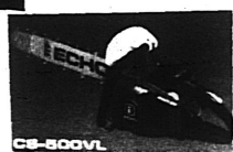
CS-550VL 650EVL 64.2cc engine weighs only 14.1 lbs. Automatic oiler 16"-20"-24" Bars anti-vibe system transistor ignition