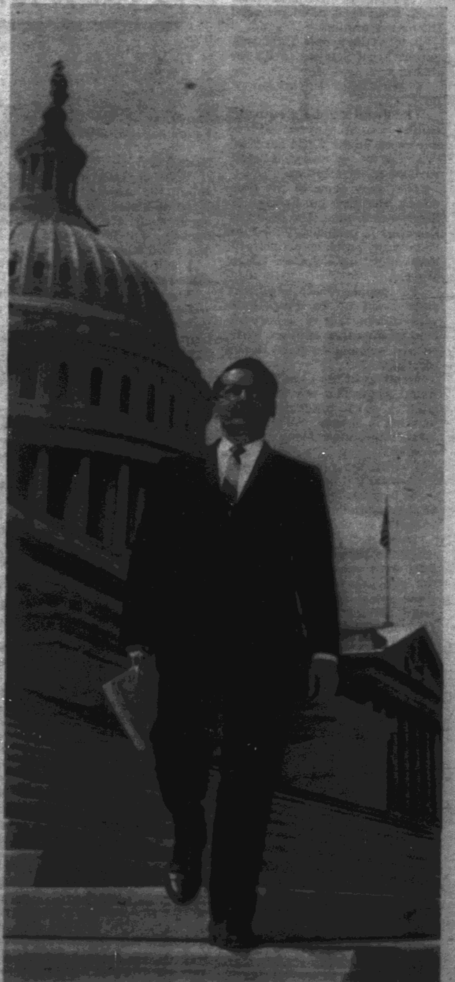
HOWARD POLLOCK—Congressman Howard W. Pollock is being opposed by State Sen. Nick Begich. Pollock is the incumbent, a Republican, while Begich is Democrat.

The U.S. Government does not pay for this advertisement. It is presented as a public service in cooperation with the Treasury Department and The Advertising Council.