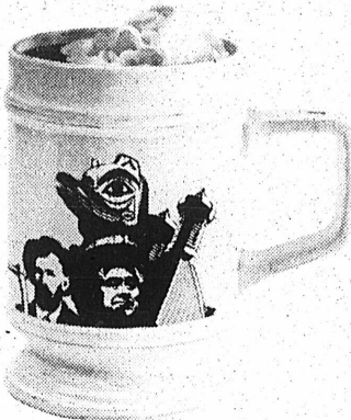
The official Top of the World Drink. Sourdough Coffee Royale for breakfast. And complimentary wine with lunch and dinner—for everyone on board who's old enough.

Ask your travel agent to put you on Top of the World.