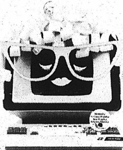
Alice is Tops. Nobody knows more about reservations than Alice, our IBM-360 computer and super reservations gal. Call and find out.