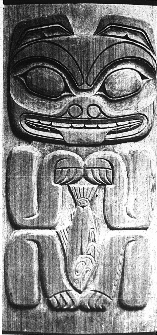
LINCOLN WALLACE. (Tlingit) BEAR. 1964. Yello cedar; 22 x 11 1/8".