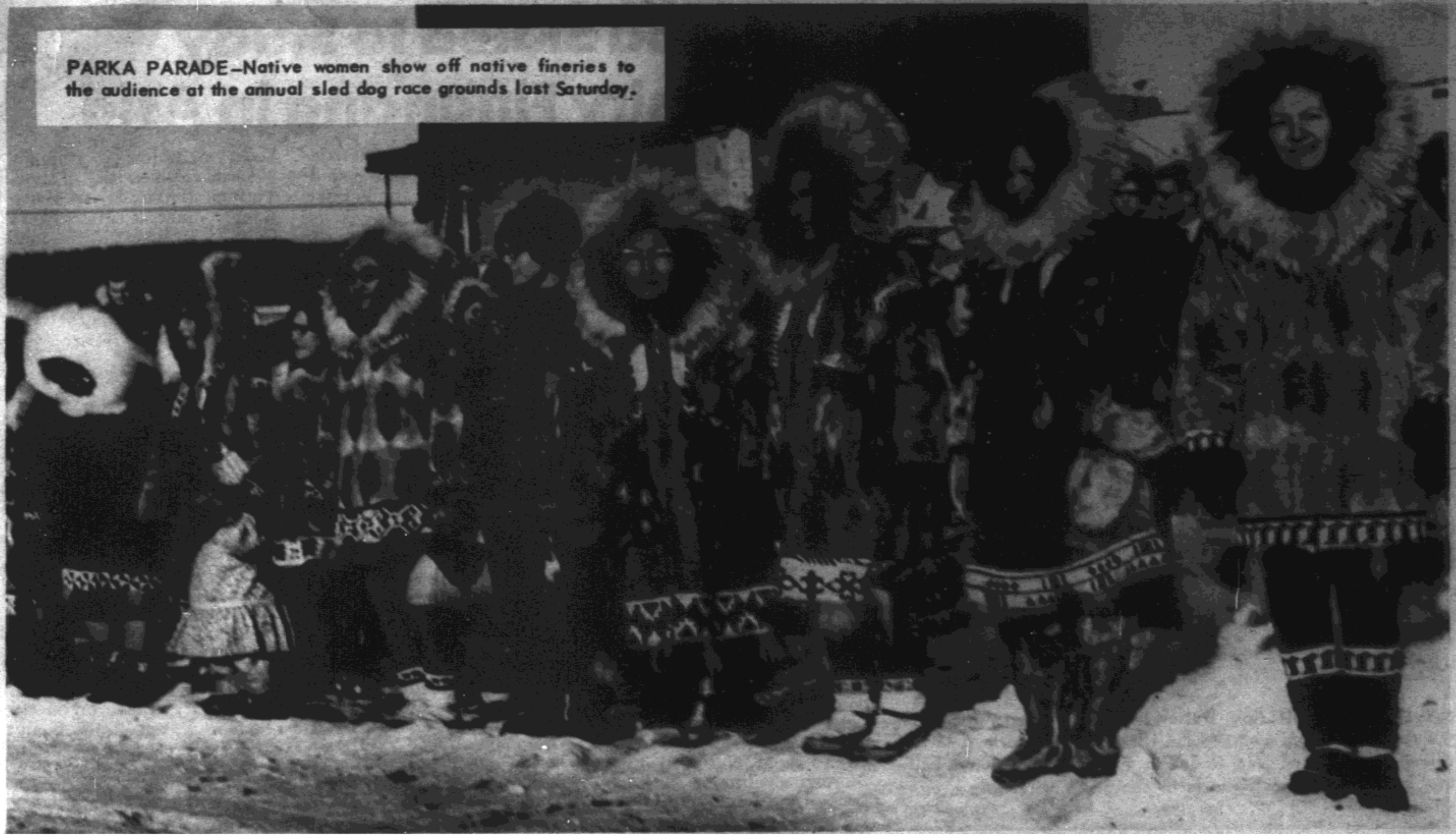
PARKA PARADE —Native women show off native fineries to the audience at the annual sled dog race grounds last Saturday.