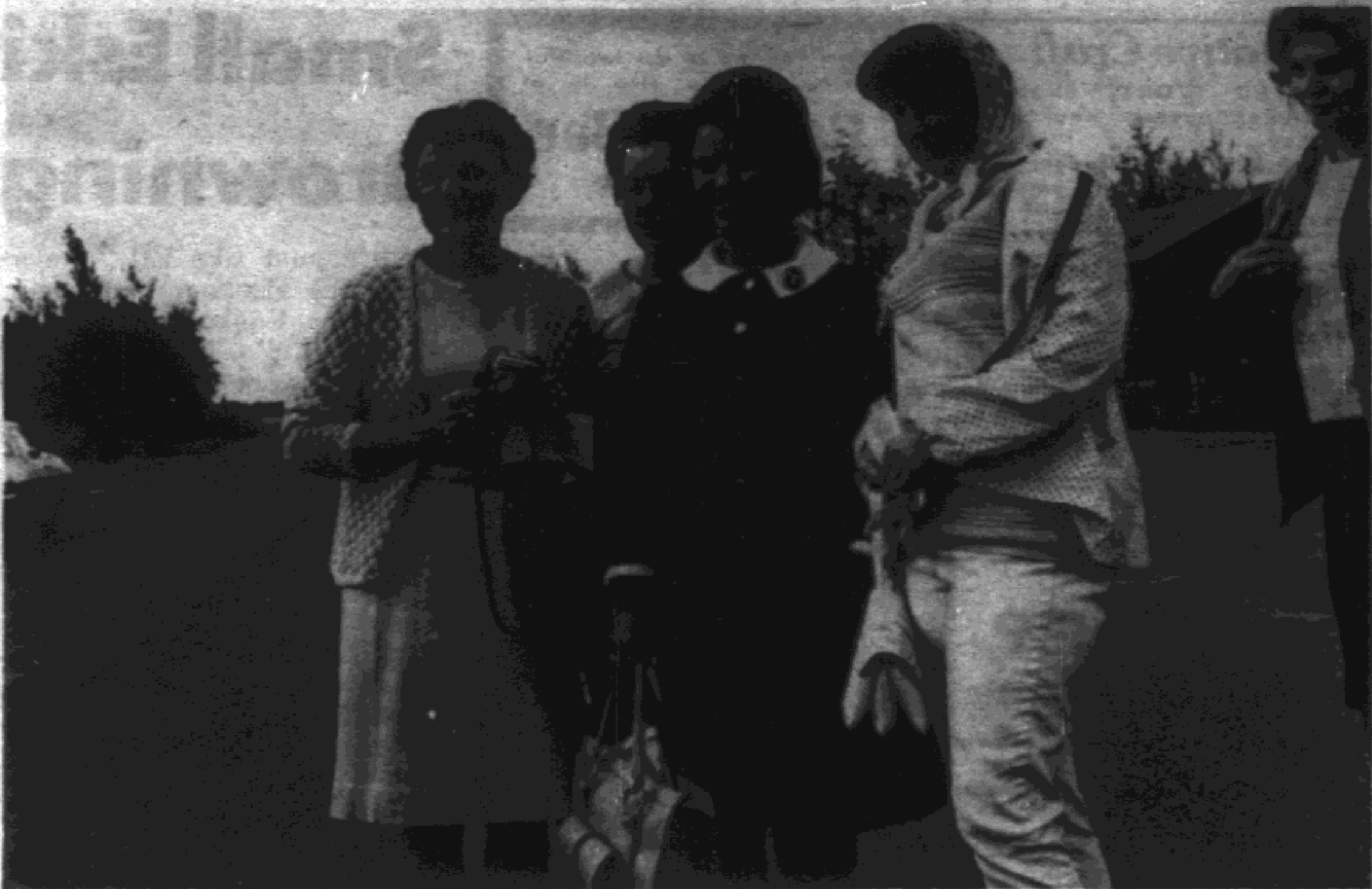
SHIRLEY TEMPLE BLACK—Mrs. Charles Black (Shirley Temple), center, poses for a picture on the street at Nenana with local women when she and her husband made a surprise visit to the Tanana River community two weeks ago. The brown-haired former child movie star famed for her curls

"This is where the schools and the university and the center of economy is. It is a great opportunity for Fairbanks and for Alaska and we should not waste any part of it," he concluded.