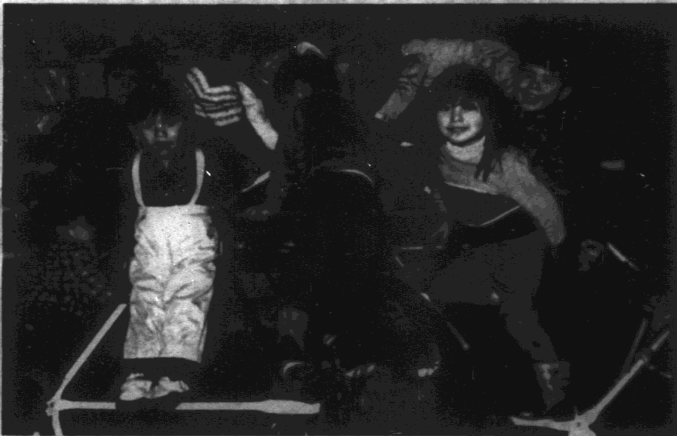
KOYUKUK—Geodesic climbing dome keeps Head Starters busy.