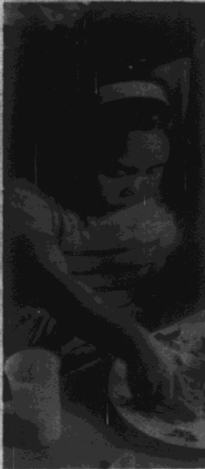
HANDS ARE BETTER—Little girl from Gambell discards her knife and fork to eat her wiener.