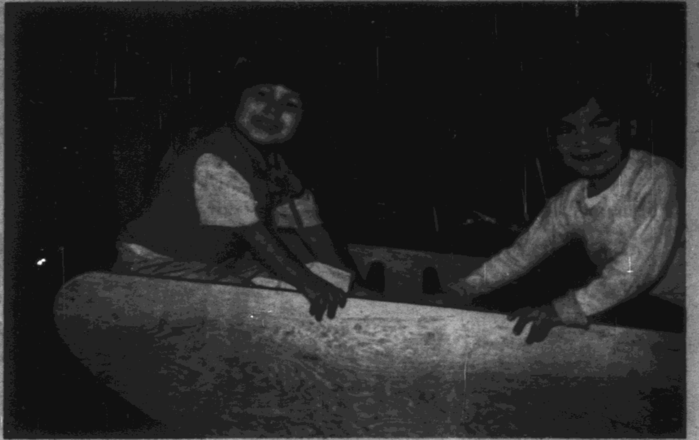
KALTAG—Kaltag village youngsters rock the time away during Head Start session.