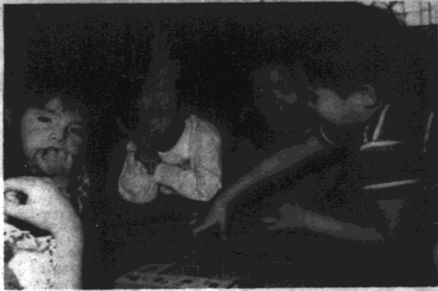
NULATO—Little Athabascans relax with a game of picture dominoes at the village of Nulato.