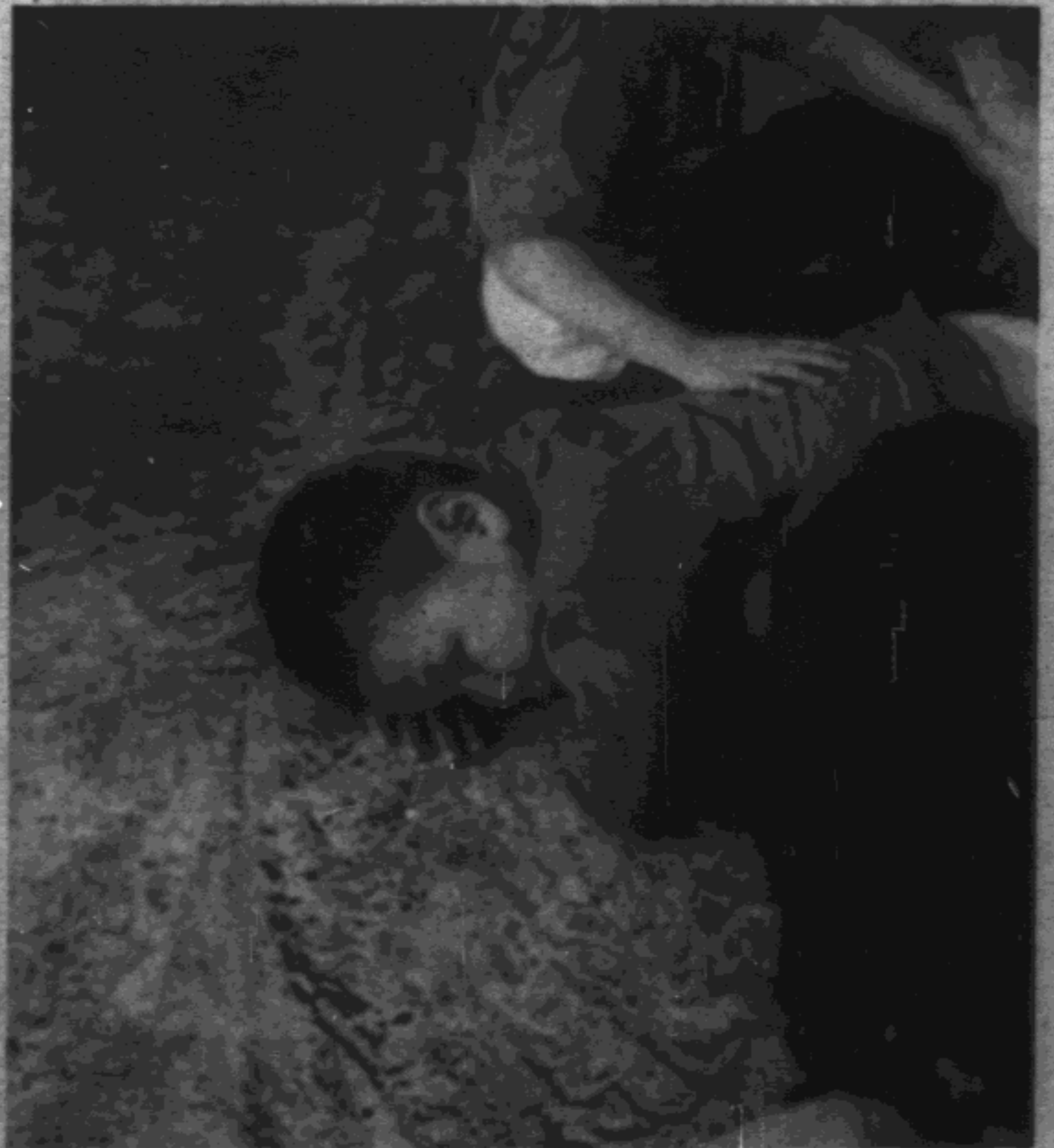
AFTER HARD STUDY—Gambell youngster is taking a rest cure after a hard session.