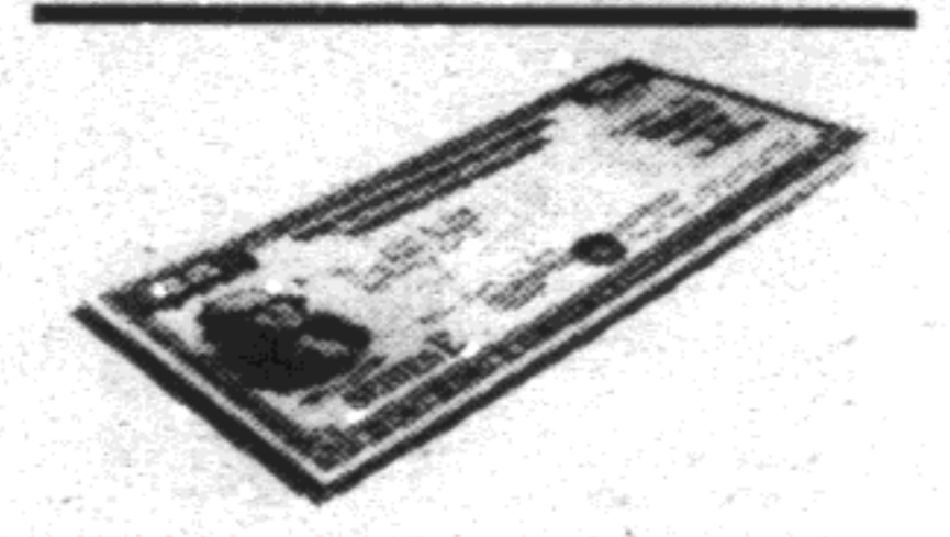
Take stock in America Buy U.S. Savings Bonds & Freedom Shares

The course is being sponsored under the Manpower Development and Training Act. Training allowances will be available for those who qualify under the act.