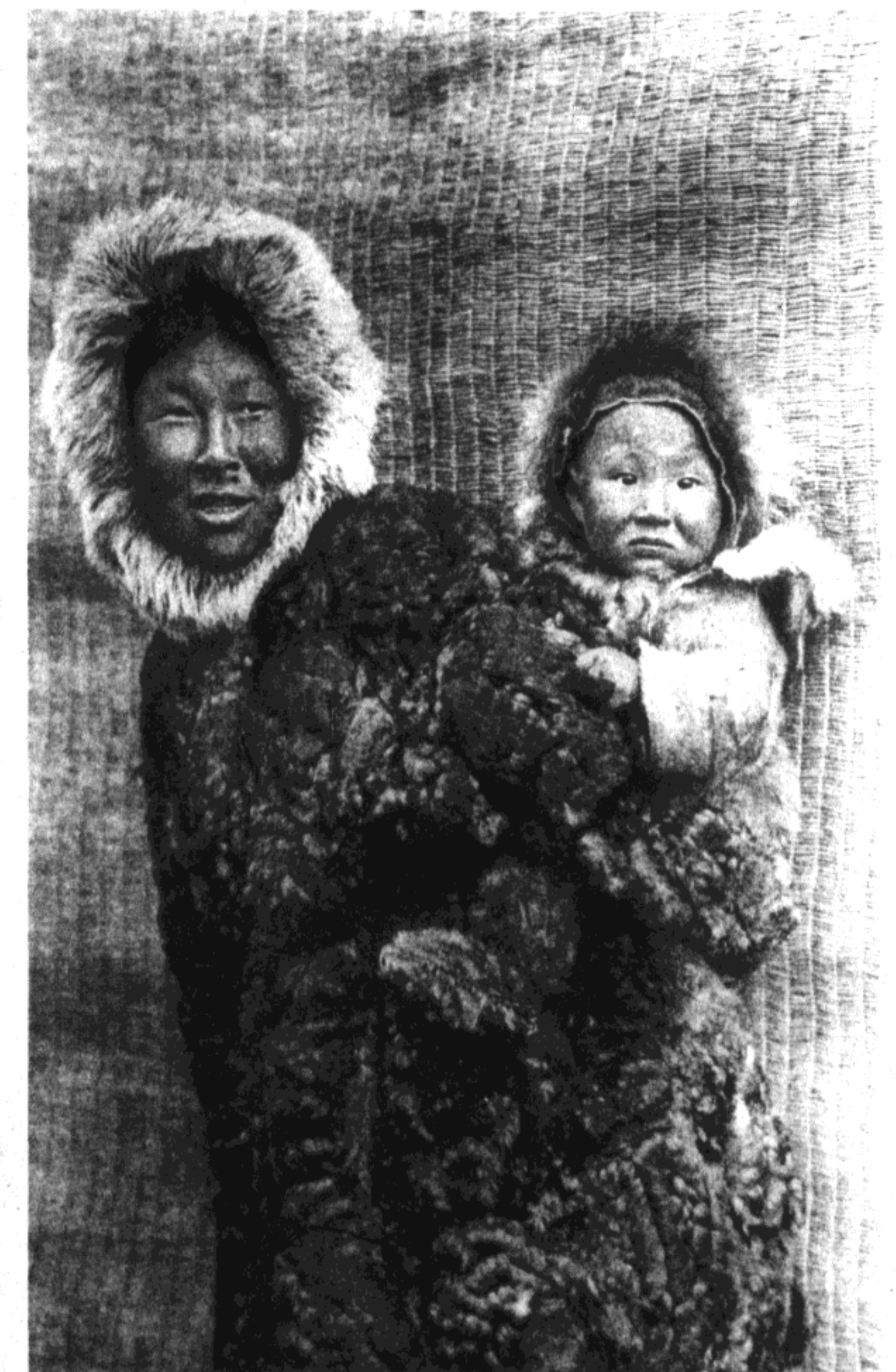
"Woman and Child - Nunivak"