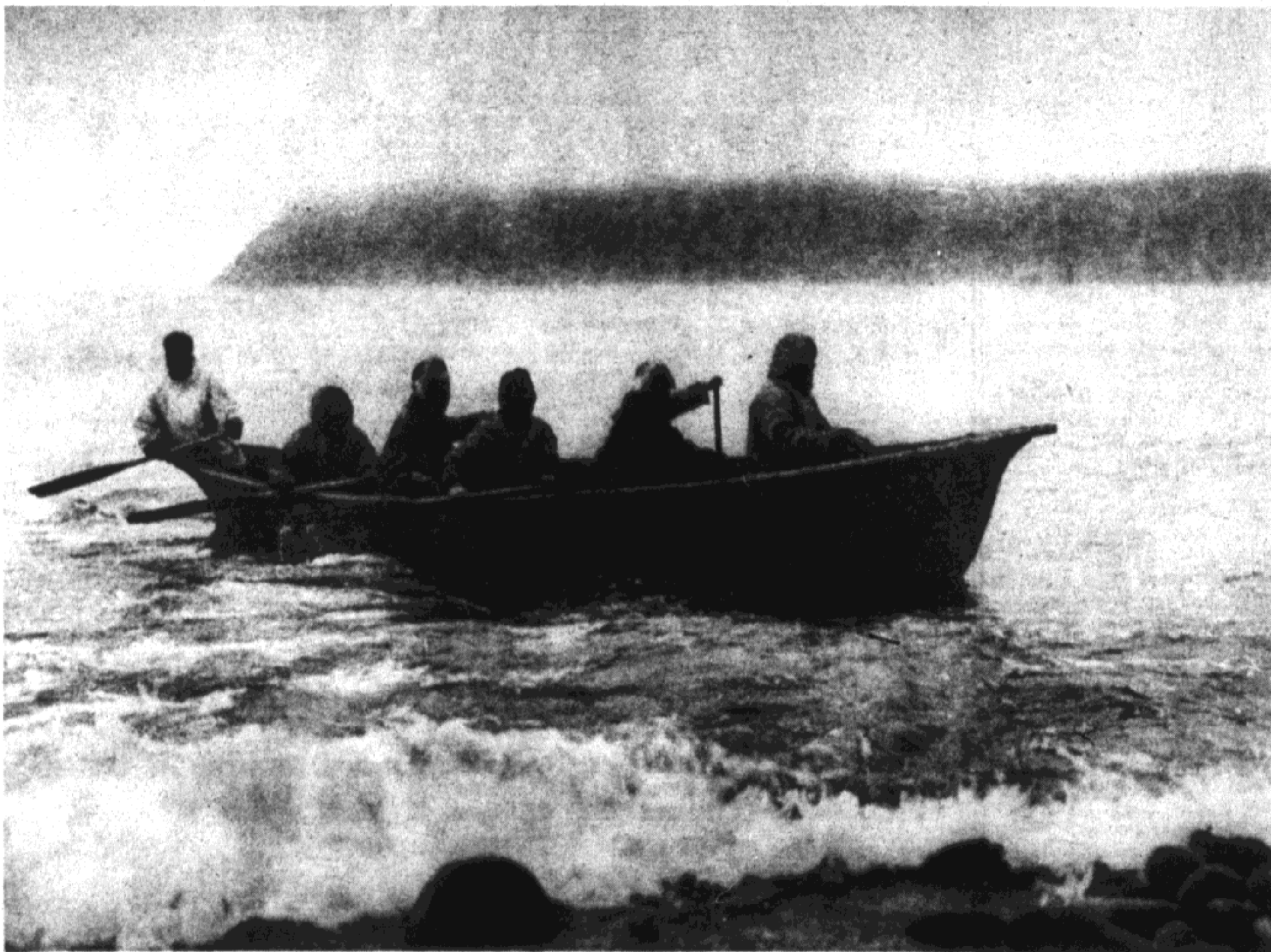
"Diomedes Boat Crew - Asiatic Shore in Distance"