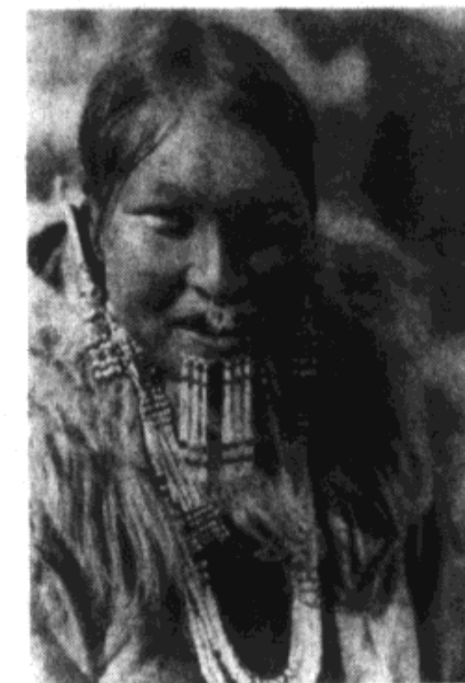
"Kenowun - Nunivak"

"Boys in Kayak - Nunivak." In the legend of another photo Curtis noted; "Children and adults of the Nunivak group are healthy as a rule, and exceptionally happy because they have been little affected by contact with civilization."