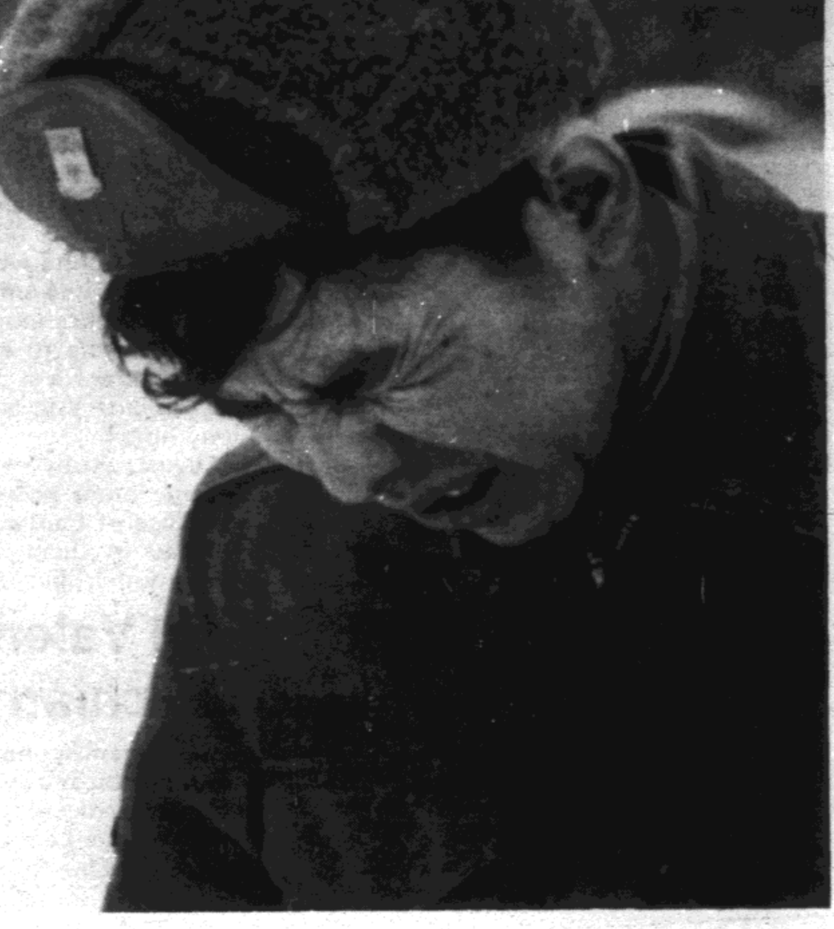
SOMETIMES TRAINING GETS TOUGH, as this Second Scout Battalion trooper from Bethel plainly shows. He has just come out of a room full of tear gas, in which he was ordered to take off his mask for a few brief seconds.

"These men are hunters, trappers, fishermen, traders, councilmen and leaders in their communities. While out on hunting and fishing trips in the shadow of Siberia, they keep an eye out for unusual things. They are the real eyes and ears of our Alaska defense."