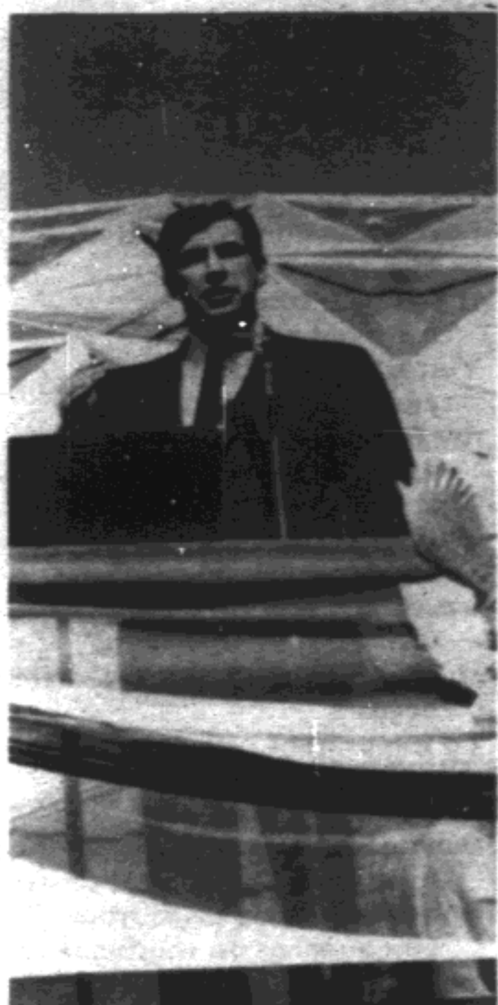
MIKE GRAVEL, shown above speaking at Fairbanks on July 4th. Gravel, the author of Jobs And More Jobs, is on a whirlwind speaking tour around Alaska to wind up his campaign challenge to Senator Ernest Gruening.