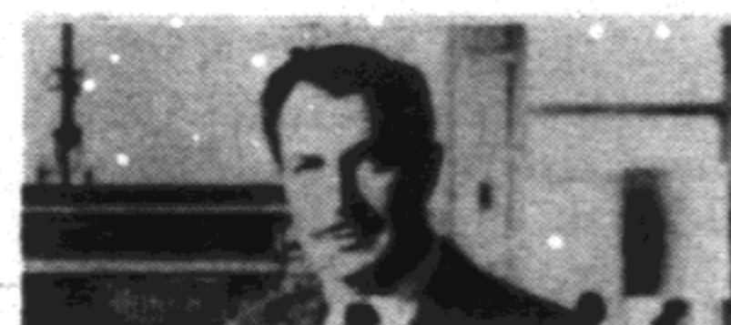
Introduction by Vincent Price

CHENA BUILDING, 510 Second Avenue, Fairbanks, Alaska