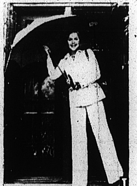
EASY-CARE COSTUME-A suit of 100% cotton from Cone Mills is shaped by Artbro, features colorful Mexican embroidery on pockets, lapels, pant yoke.

You should wash jeans that are made-to-fade separately. The hotter the water, the faster they fade.