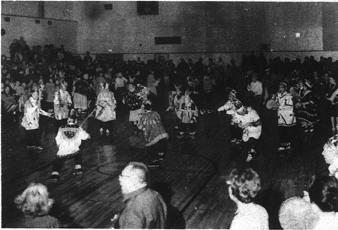
GRAND FINALE —Dancers from all participating groups joined in one final dance at the Potlatch last Friday. Visible in the background is a portion of the audience, which overflowed the stands at the Monroe gym.