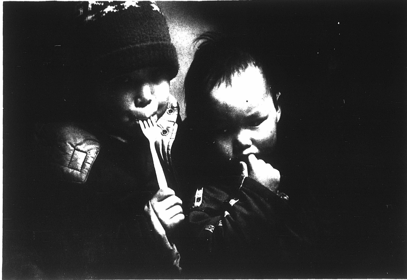
Young Chupiks sample pot luck delicacies (above). The waterfront (below) is full of activity.