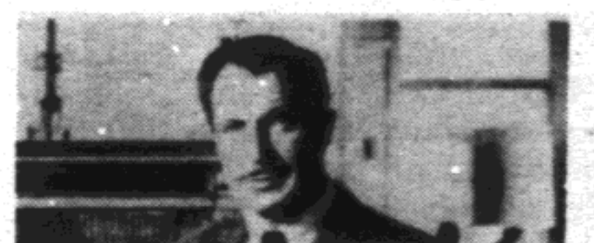
Introduction by Vincent Price