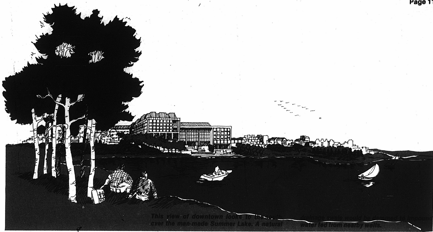
This view of downtown looks to the south over the man-made Summer Lake. A natural water fed from nearby hills.