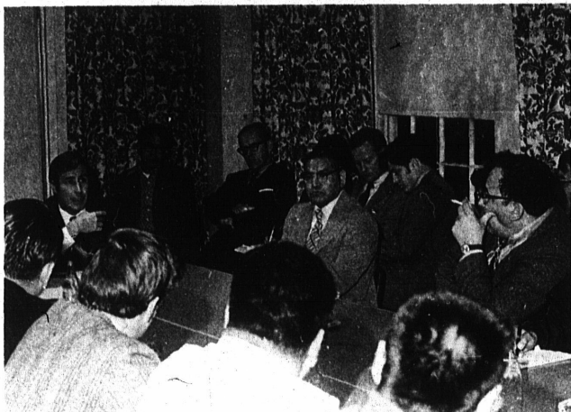
AFN BOARD—The Board of Directors of the AFN are meeting with Alaska's Senator Mike