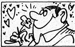
Sentimentalists The barrenest of all mortals.