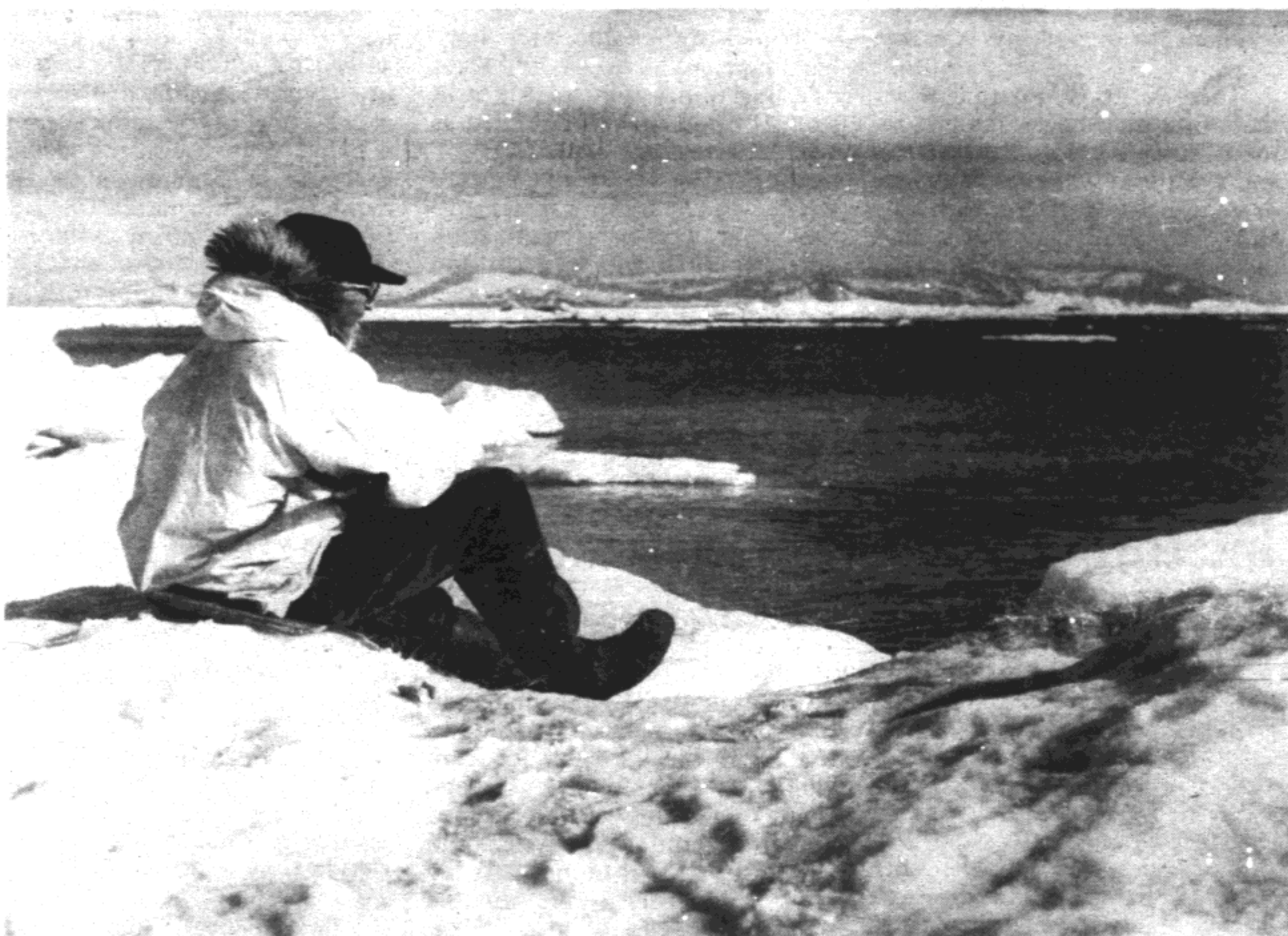
THE HUNTER—The hunter from Cape Prince of Wales is scanning the waters of the Bering Strait for seals, oogrucks and walrus. Although the man is hunting in the warmer weather of spring, the

hunters of the Arctic are now beginning to seek game in the ever growing cold.