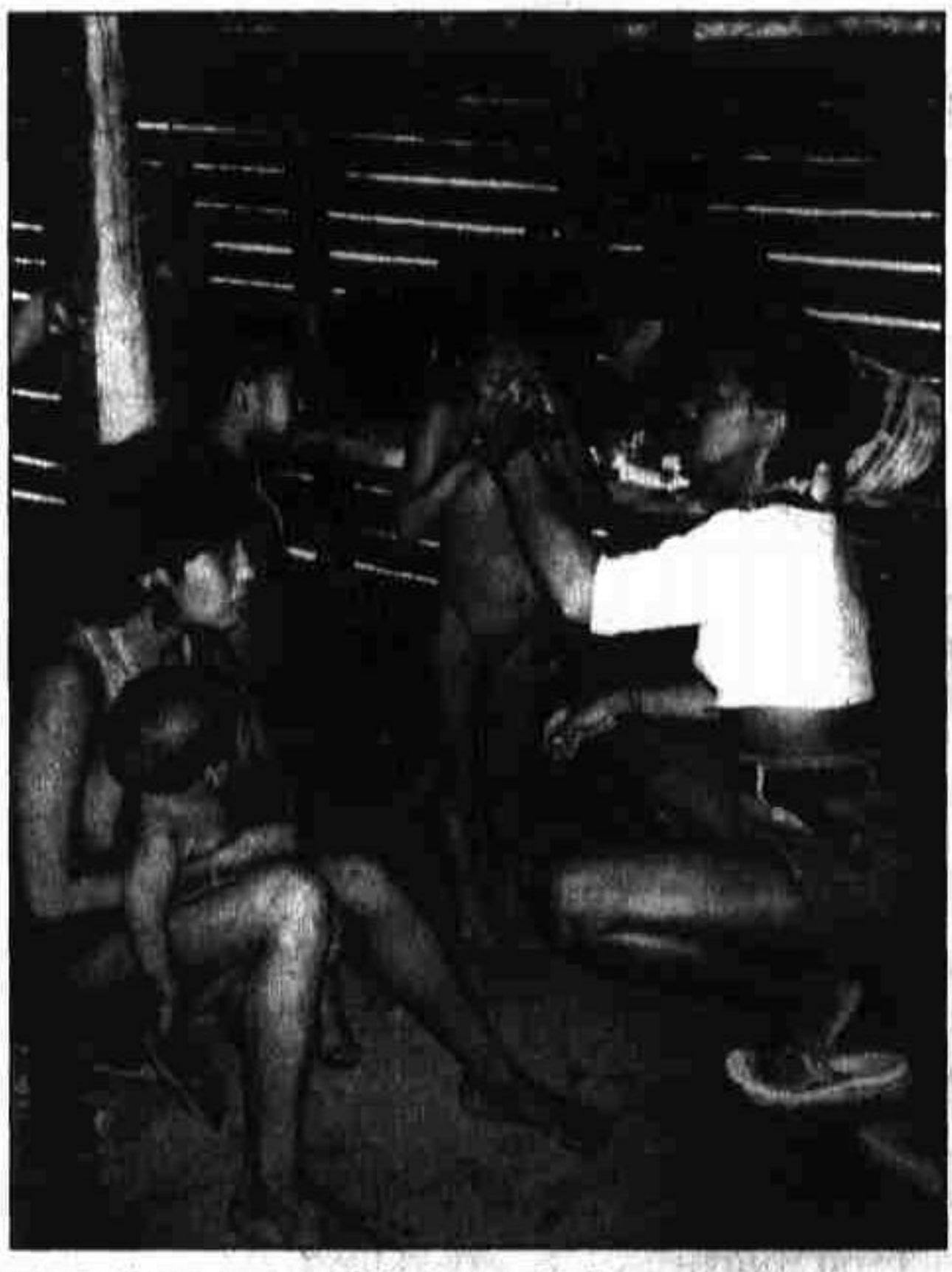
Circuit riding nurse shares drink of water with Yanomami children.