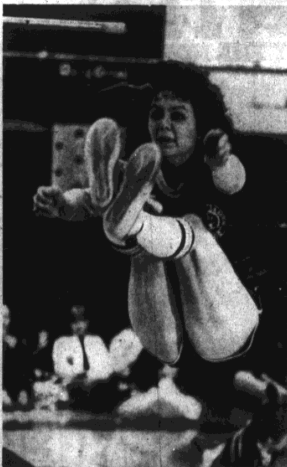
Lady Laroux of Bethel clears her mind of all distractions as she prepares to go after the world's record.