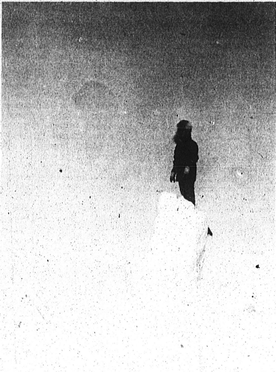
SCANNING THE CHUKCHI SEA — Captain of the crew, Seymour Tuzroyluke, is scanning the sea on a lead for whales that might come by.