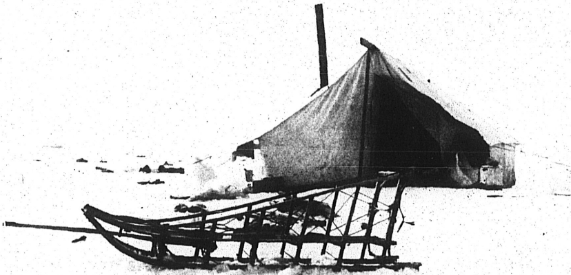
THE COOK TENT — The tent set up on the ice of the Chukchi Sea is one of the necessities where women cook for the crew. The sled is used for hauling meat and muktuk pulled by dogs or sno-gos.