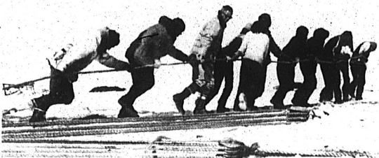
HELPING TO PULL — Sen. Buckley, center, is helping the whalers to pull a part of the whale onto the ice.