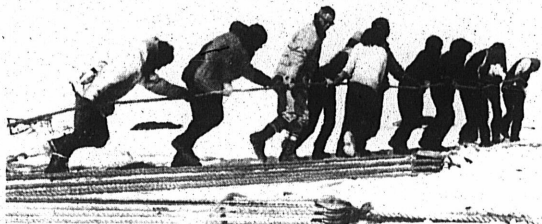
HELPING TO PULL — Sen. Buckley, center, is helping the whalers to pull a part of the whale onto the ice.