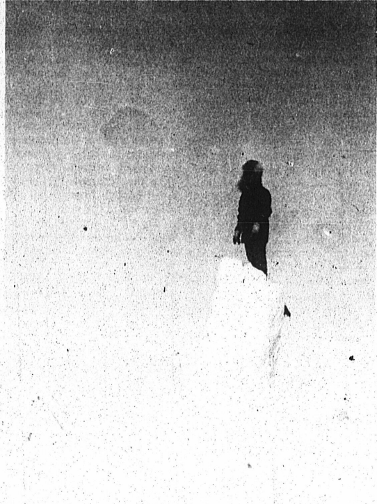
SCANNING THE CHUKCHI SEA — Captain of the crew, Seymour Tuzroyluke, is scanning the sea on a lead for whales that might come by.