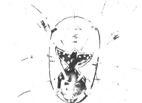
ELABORATE MASK — (Eskimo) Lent by the Hambrugisches Museum fur Volkerkunde und Vorgeschichte, Hamburg, Germany.

The bringing together of these long-scattered works is a nostalgic homecoming for many beautiful pieces of Alaska native art.