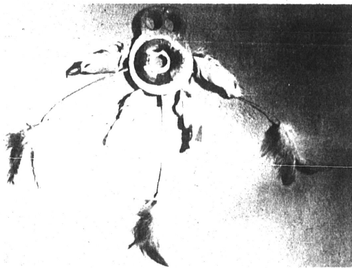
ANVIK ESKIMO MASK — This unique mask was loaned to the National Gallery of Art by Shelton Jackson Museum in Sitka.