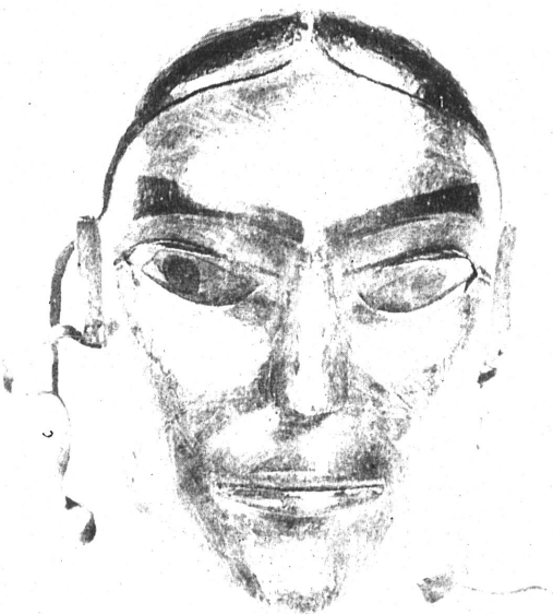
MASK WITH MOVING EYES — (Tlingit) Lent by the Museum voor Laud en Volkenkunde, Rotterdam, The Netherlands.