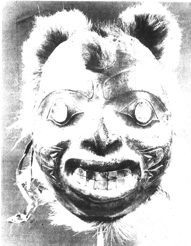
SEA BEAR MASK — (Tlingit) Lent by the Museum of Primitive Art, New York.