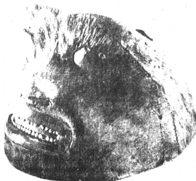
BEAR HELMET — (Tlingit) Lent by the Museum of Anthropology and Ethnography, Leningrad, USSR.