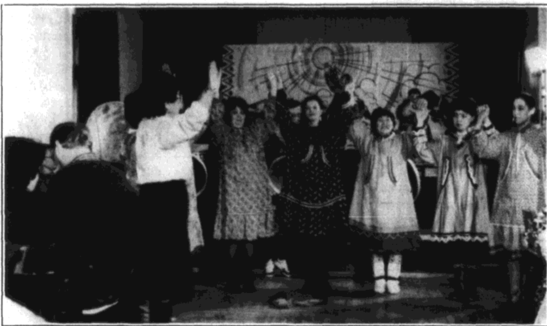
The 'White Sail' Dancers perform in Lavrentiya at the 'Yetti' Native club.