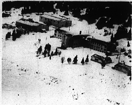
ST. MARY'S SCHOOL and dormitories from the air in early morning on most recent flight. Frozen Andreafsky River in foreground.