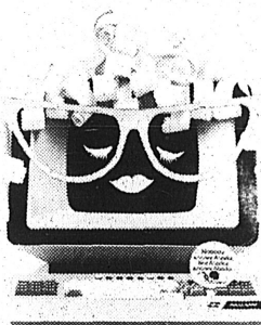
Alice is Tops. Nobody knows more about reservations than Alice, our IBM-360 computer and super reservations gal. Call and find out.