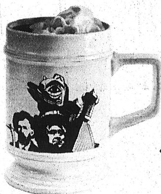
The official Top of the World Drink. Sourdough Coffee Royale for breakfast. And complimentary wine with lunch and dinner—for everyone on board who's old enough.

Ask your travel agent to put you on Top of the World.