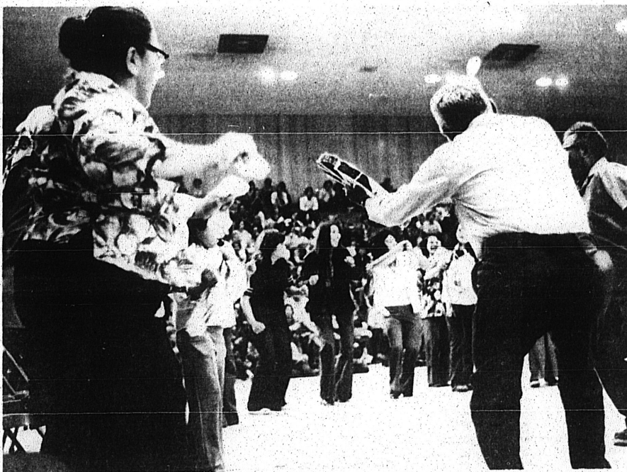
MINTO DANCERS — Few in number this year, the Minto Dancers invited dancers from the audience to join them, and they won the competition in the Indian division.