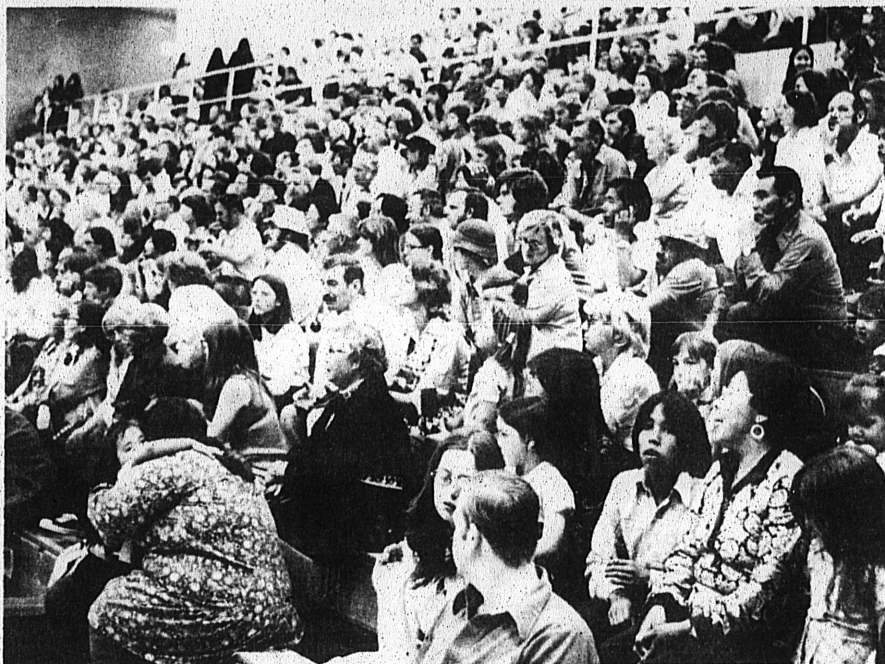
RECORD CROWDS — Probably the largest crowds ever to see the Olympics crowded the Patty Gym at the University of Alaska to watch the activity.