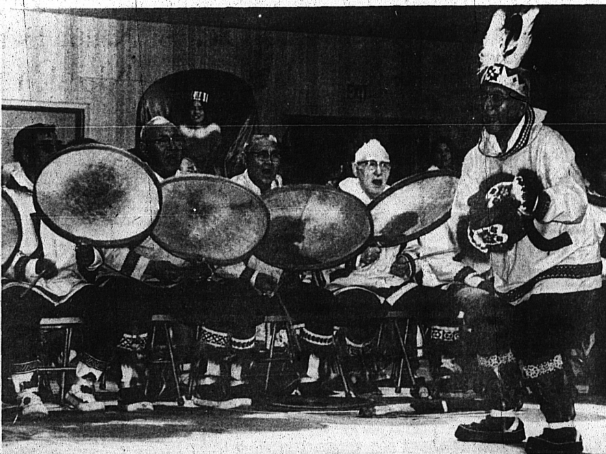
DANCE WINNERS — The Barrow Dancers, winners of first place in the Eskimo Dance Competition.