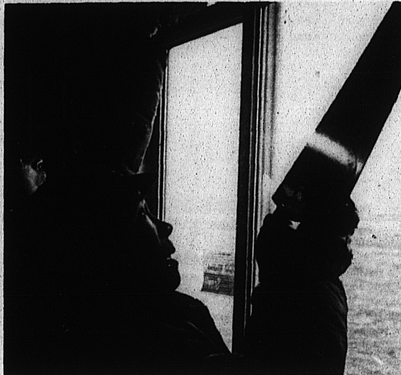
LEARNING MAINTENANCE —Here students at the Kuskokwim Community College are learning building maintenance trades at the workshop of the KCC facility.

The Kuskokwim Community College differs from older community colleges not only in terms of rapidly growing student population, but also in terms of complexity of its delivery system. About half of KCC's