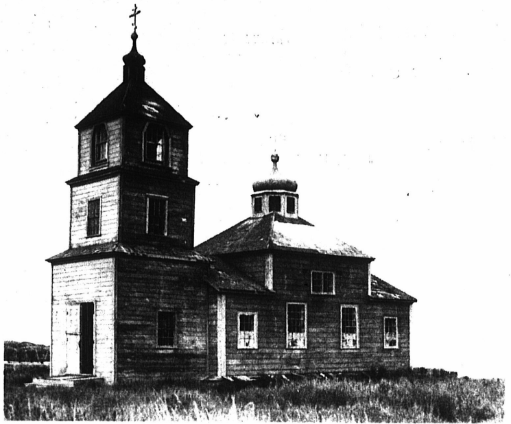
Russian Orthodox church at St. Michael.