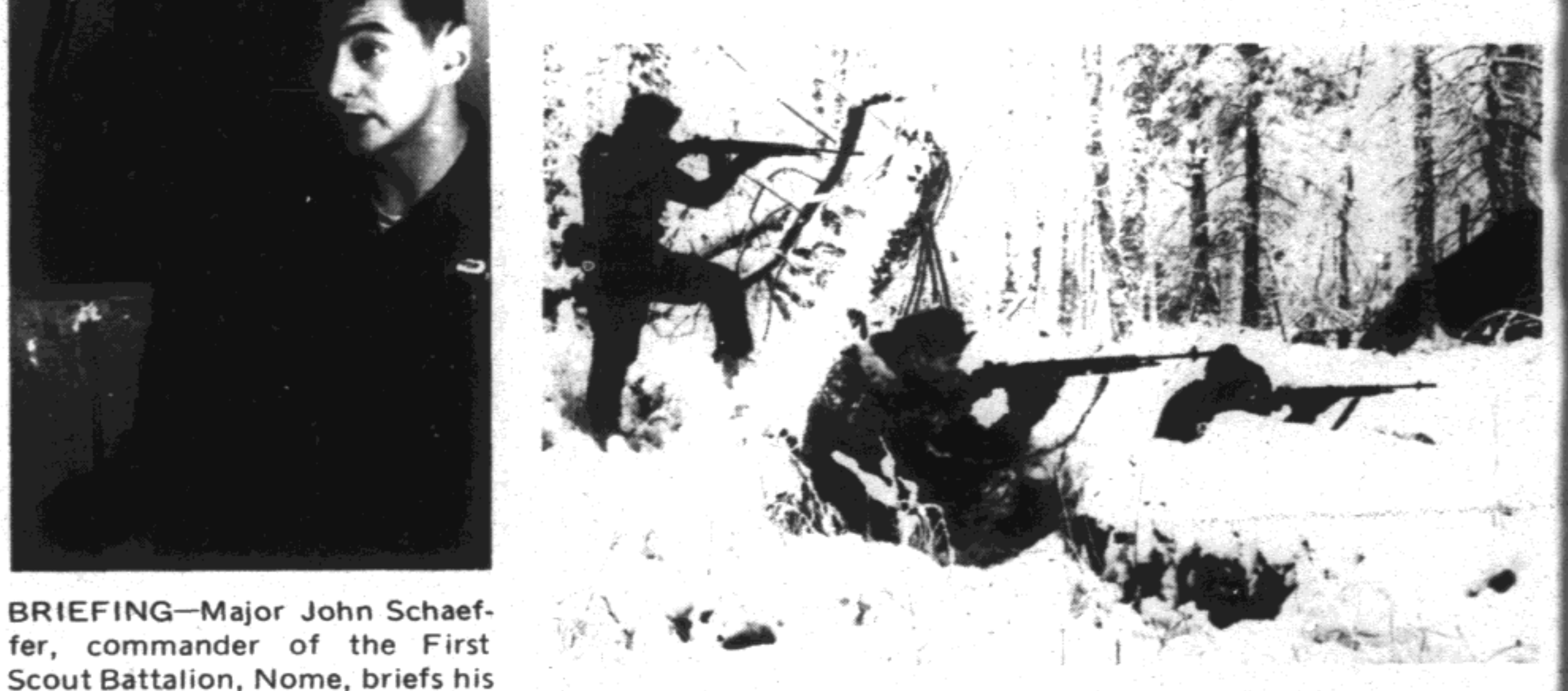
ATTACKING-Company D, from Barrow, attacks an 'enemy' position through the woods. Tactical sessions were frightenly realistic but the firing was from blanks, not bullets.

The Guard's annual winter encampment is eagerly looked forward to among the scattered Eskimo Scouts, for on free time the men can visit old friends from other villages and get into Anchorage to buy supplies and equipment to ship home, at their own expense.