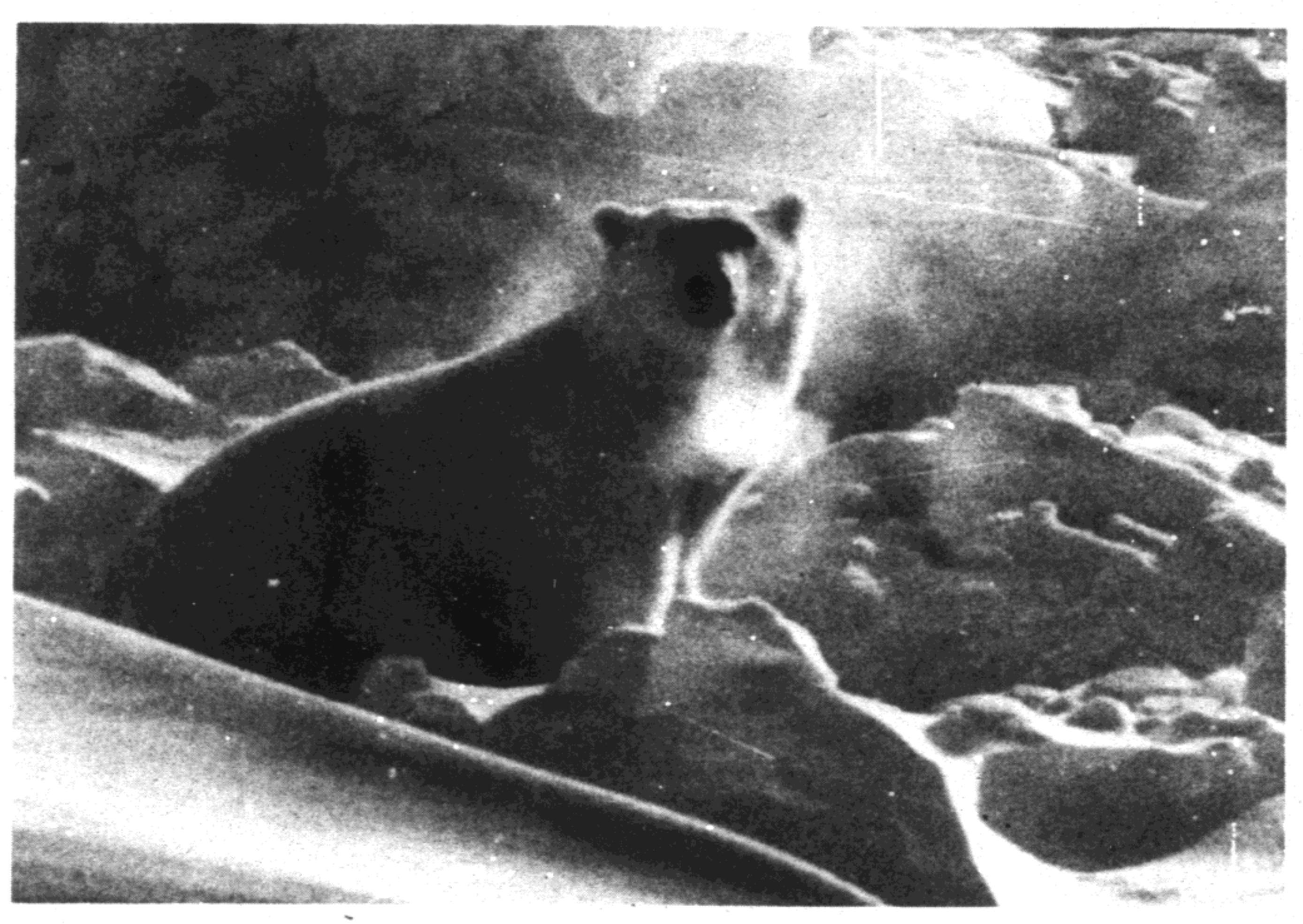
BETRAYED ONLY BY his black snout and eyes, a bear seems as interested in our photographer as