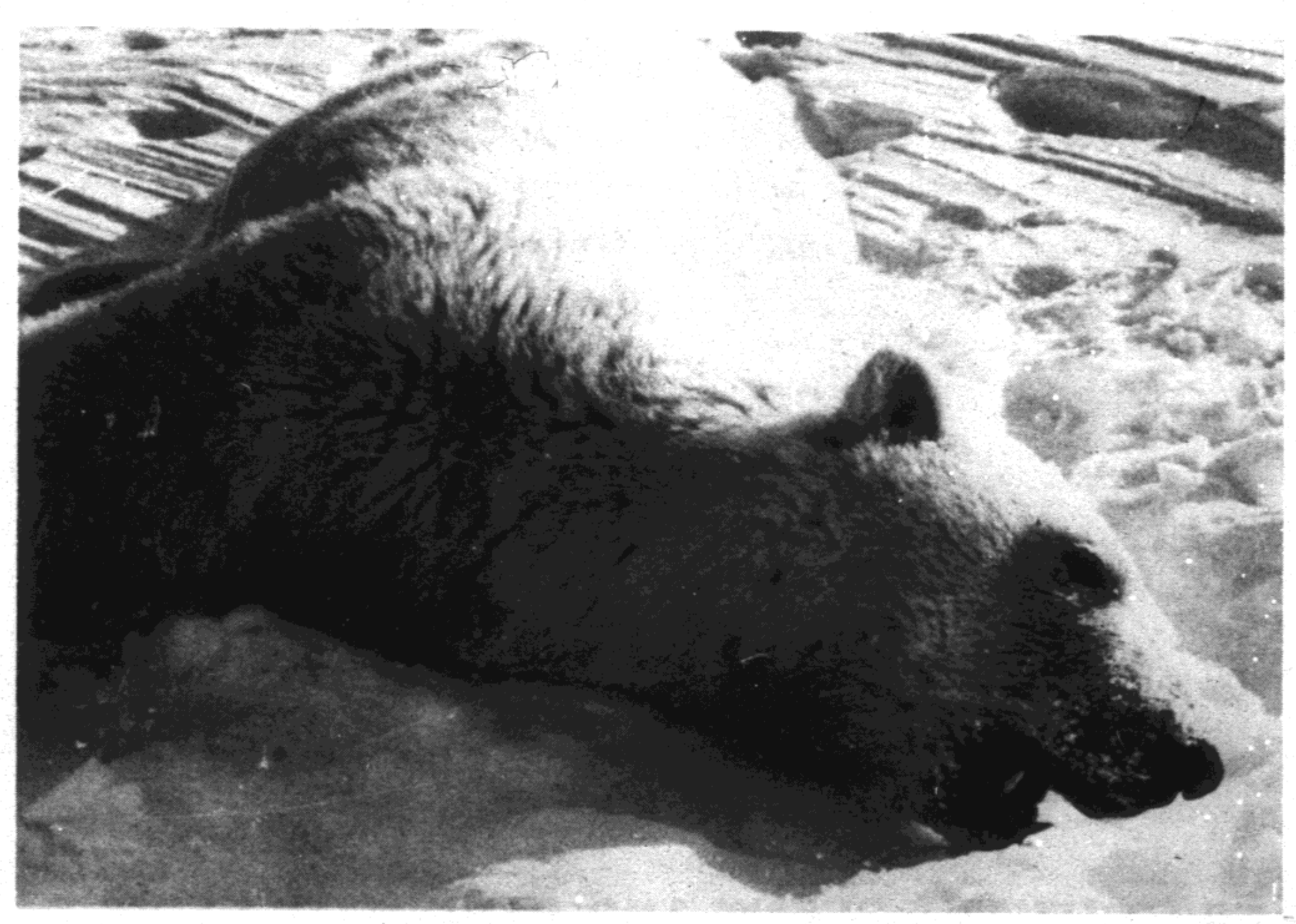
THIS HALF-TON BEAR is not dead. He's not even asleep. He is just resting quietly from the