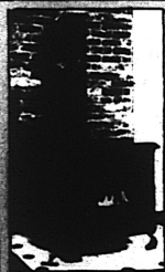
HEARTHSTONE II Largest Selection in Alaska