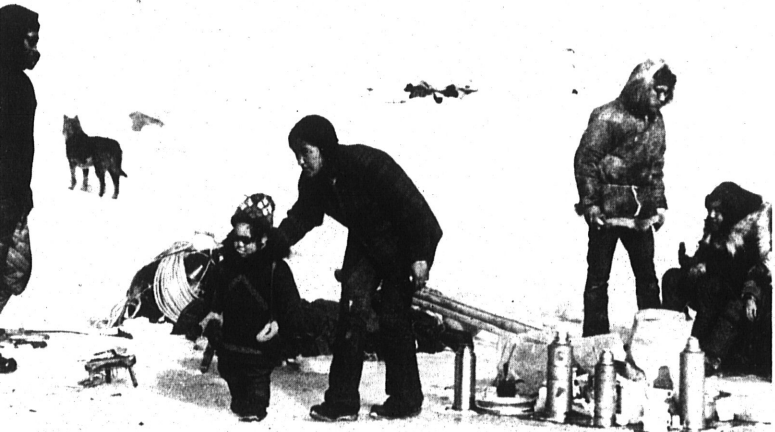
CAPTAIN'S WHALING CAMP — When a whale is caught even children come out to the whaling captain's camp. Note the cook tent in the back-

ground. Also note thermos bottle containing hot soups and coffee.