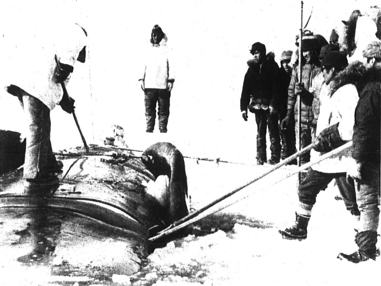
PRECISION BUTCHERING — The Point Hope whalers cut up the whale in a precise manner which expedites the cutting of the whale. This is a must because sometimes ice conditions are

such that the whale has to be cut up in the shortest time possible.