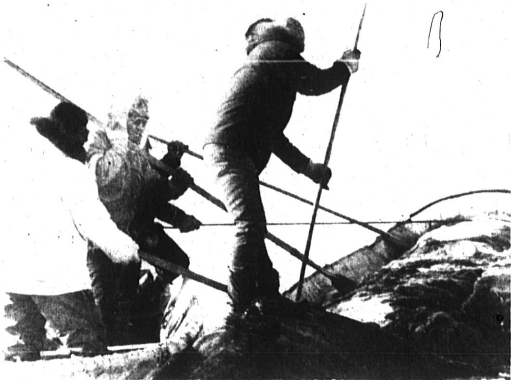
TEAMWORK — Teamwork is important in cutting up a whale. This is designed to do the work in a shortest time possible because of the unpredictability of the Arctic ice, currents and winds.