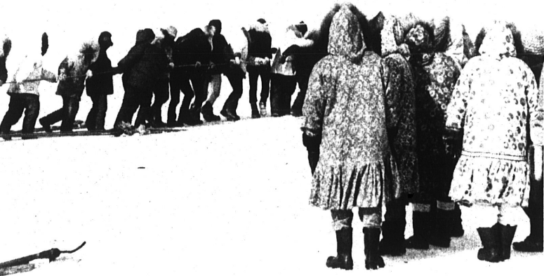
PULLING UP WHALE — The whalers are straining on the rope of the block and tackle used to pull up whales on the ice if they are not too big.

the 60-tonners cannot be pulled up on the ice because of their size.