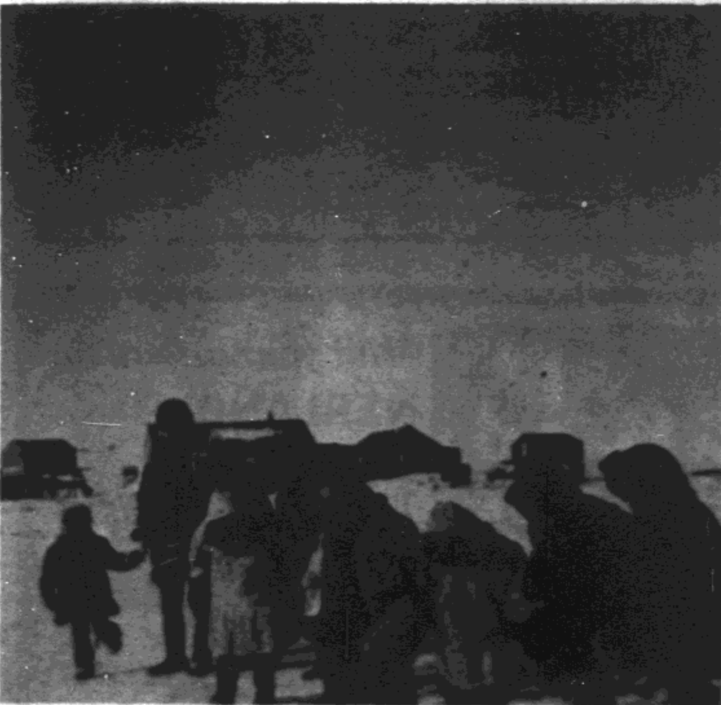
HOP-HOP RACE —Ina Keen is directing Kasigluk pre-schoolers on the Hop-Hop Race.

The village of Kasigluk with a population of 107 is probably enjoying a top percentage of enrollees in its adult education class in the state or for that matter, the world.