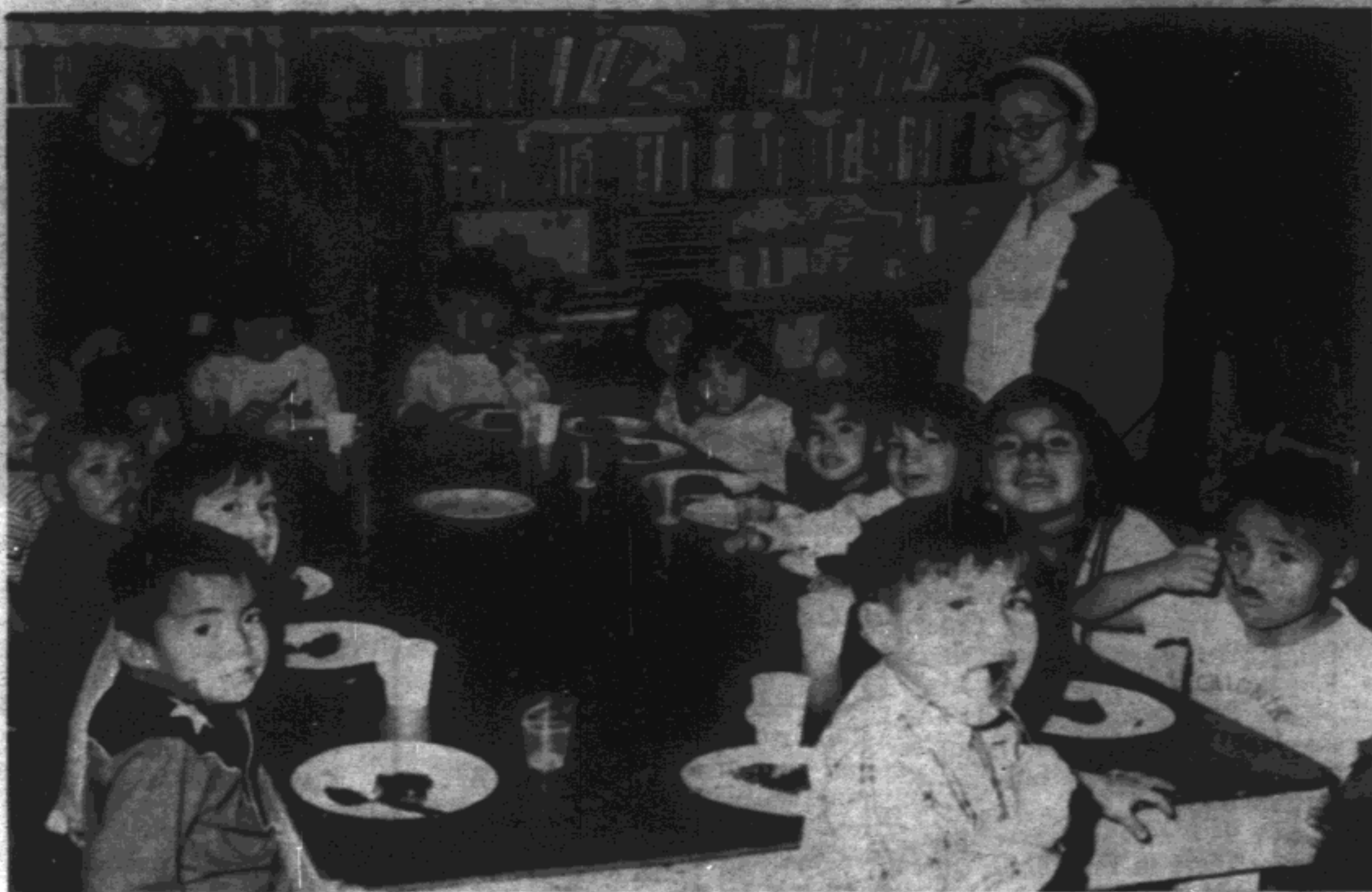
KALTAG HEAD START PROJECT —Little Athabaskan Indian tots of the village of Kaltag are enjoying lunch at the Women's Club house where the villagers are continuing Head Start Program

on its own by having bake sales, through donations and volunteer help. Head Start program is the highly thought of project in Alaska's native villages.