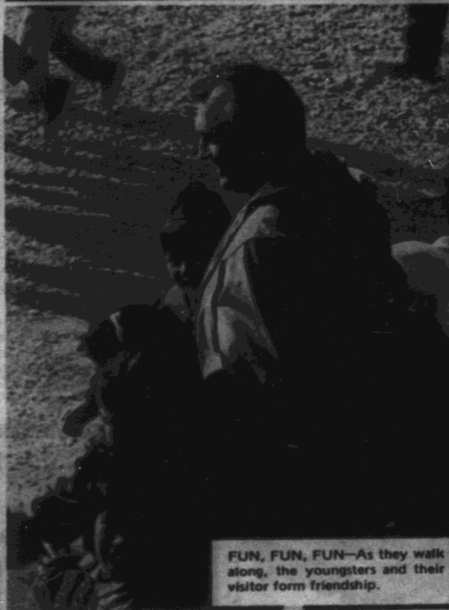
FUN, FUN, FUN —As they walk along, the youngsters and their visitor form friendship.