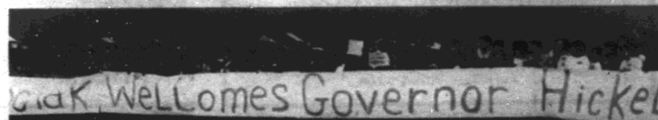
GREETERS COMMITTEE —Togiak young folks with placards and all hold up welcoming streamer for the Governor.