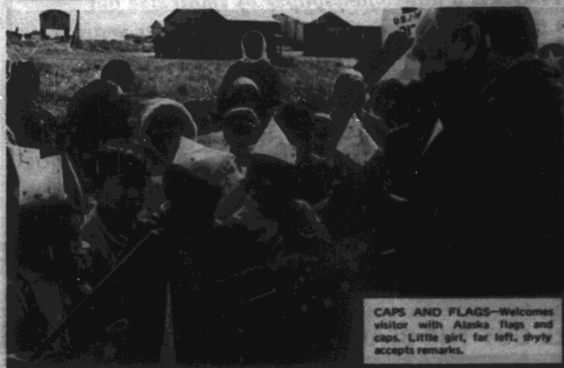
CAPS AND FLAGS —Welcomes visitor with Alaska flags and caps. Little girl, far left, shyly accepts remarks.