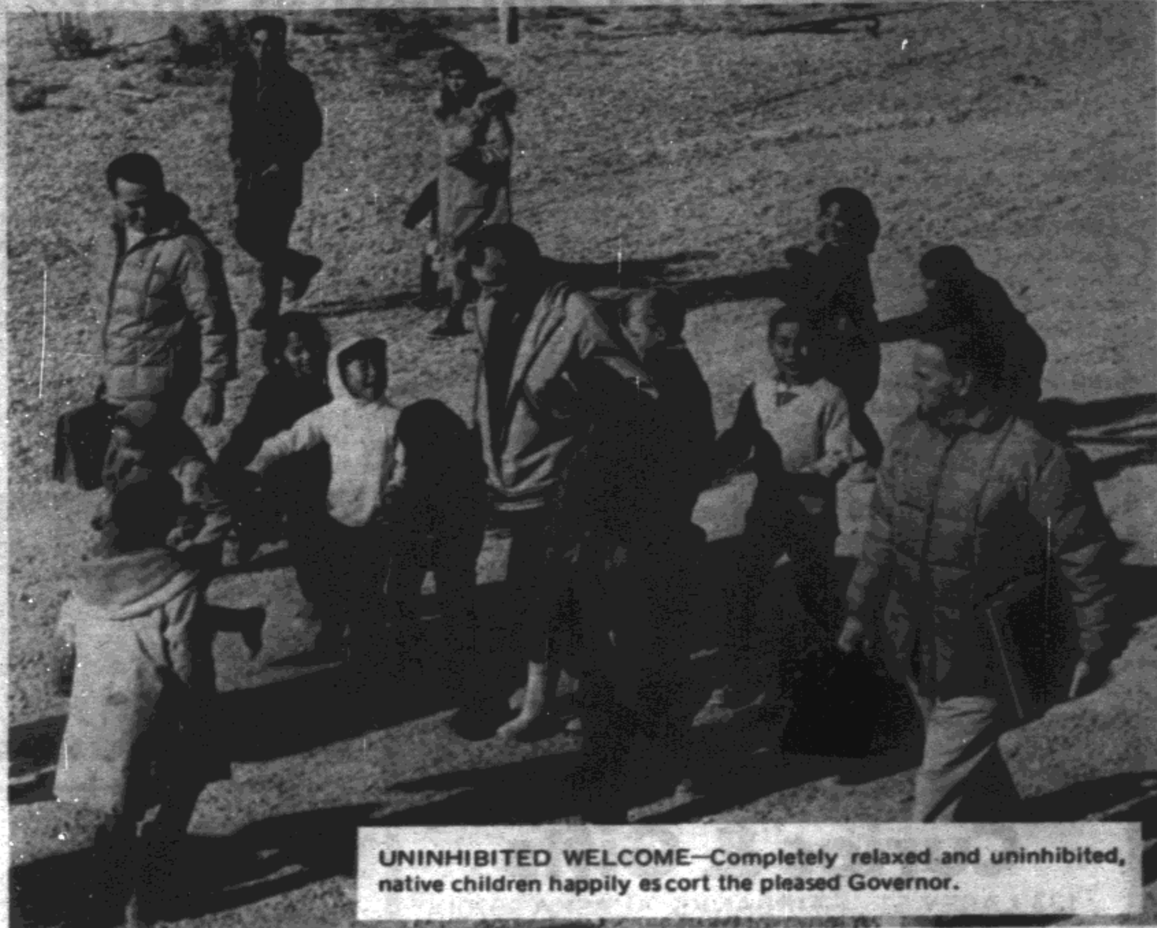
UNINHIBITED WELCOME —Completely relaxed and uninhibited, native children happily escort the pleased Governor.