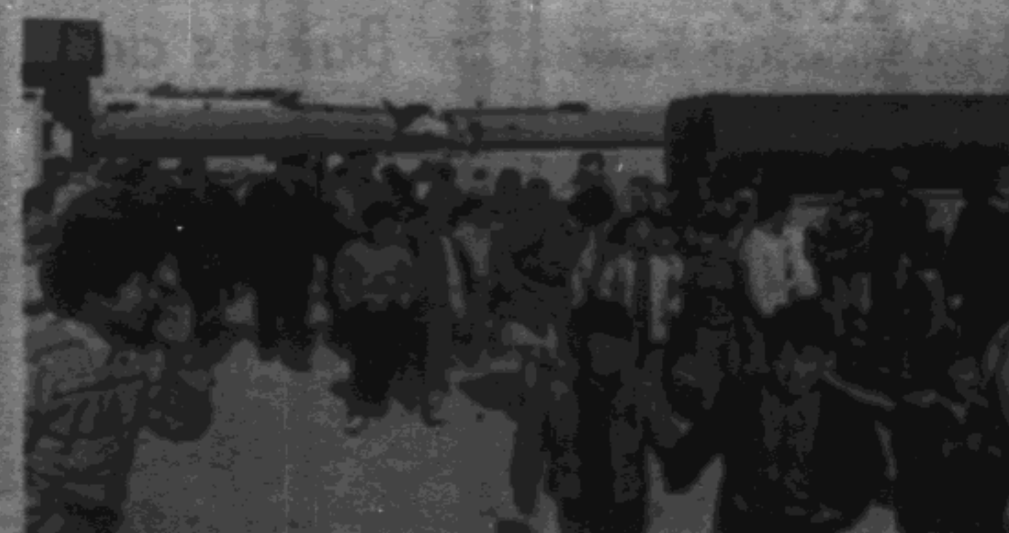
TELLER GREETING —After converging on the Governor's plane, Teller youngsters escort their guest to the village.