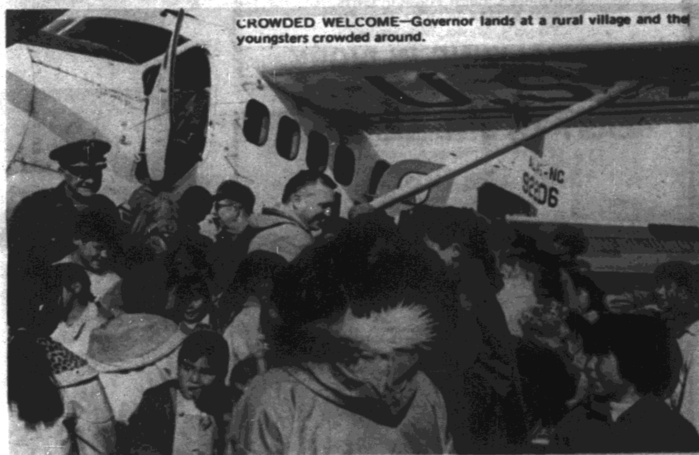
CROWDED WELCOME —Governor lands at a rural village and the youngsters crowded around.